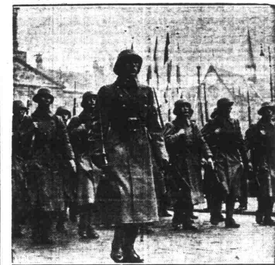
The Netherlands brings all Dutch army stations up to wartime strength as France warned she would support any neutral attacked by the Germans. Dutch troops are marching out of Amsterdam.