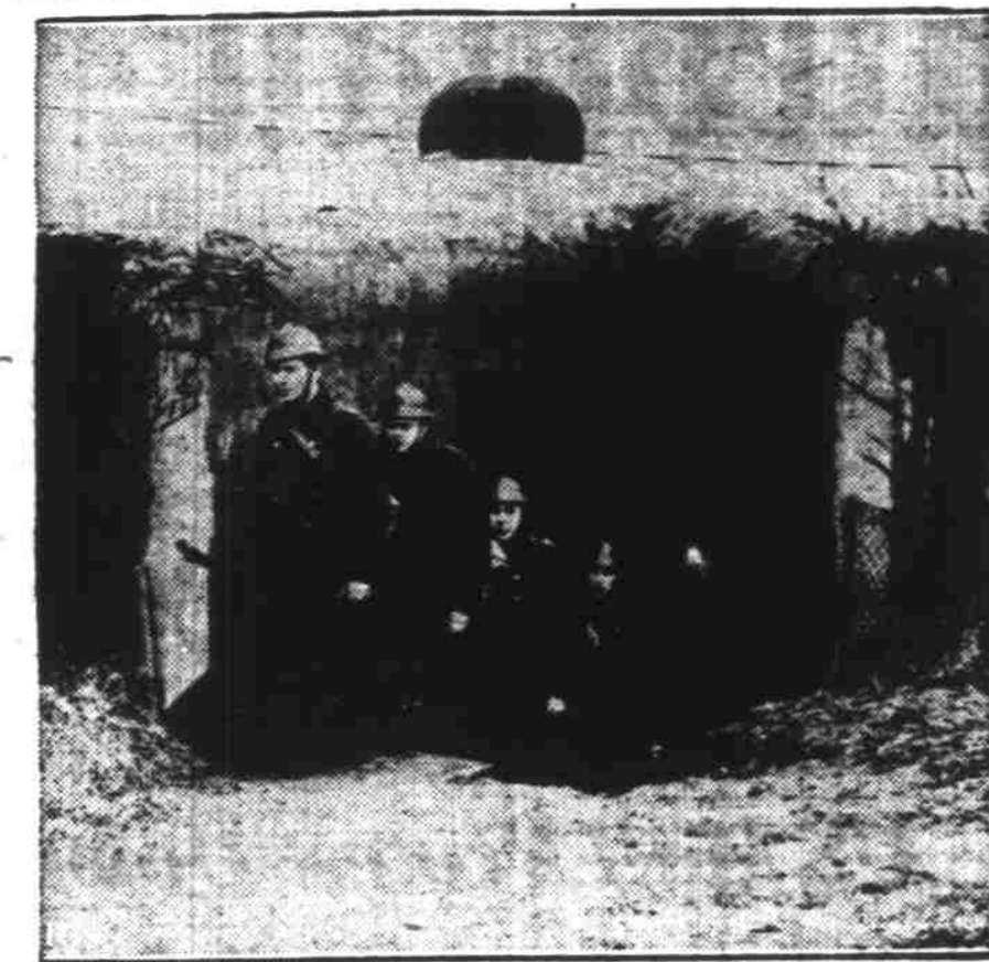
Russian troops emerge from a frontier fortification near the German border as 700,000 reservists are called to the colors as preparations for any possible moves by Hitler.