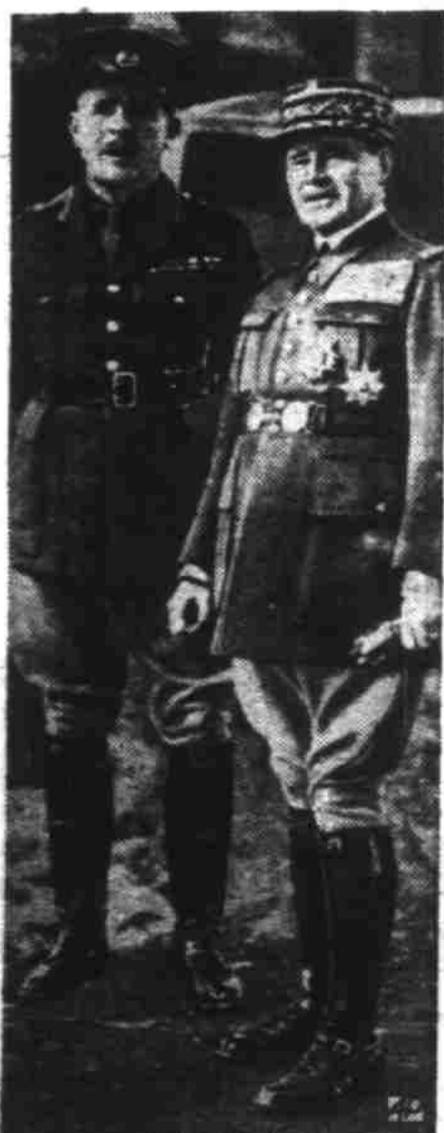
ALLIES —These war "buddies" whose main concern is the land strategy against Germany are General Gamelin (right) of France, who commands French and British forces in France, and Viscount Gort, British commander-in-chief.