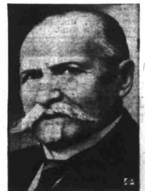
MAN OF WOE —Heavy is this old man's burden, for he is Kyosti Kallio, 66, a peasant's son who became president of Finland, must now guide his country through war.