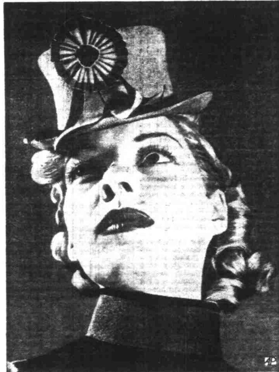
WHERE'S THE HORSE? —Snow might flurry outside but New York could still have a fashion show of spring hats, among them this red "coachman's" straw with the saucy red and black grosgrain cockade in front.