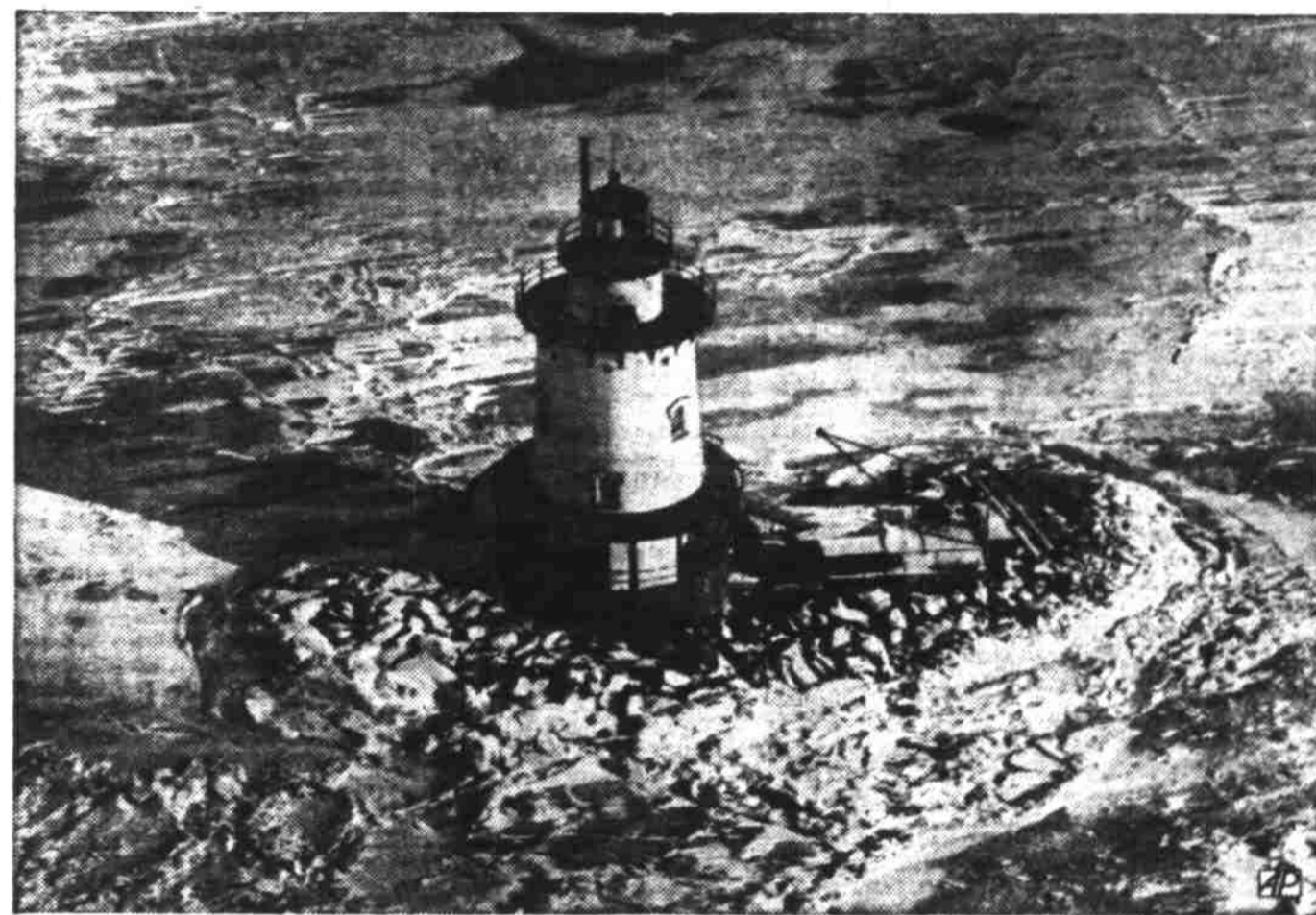
HOUSE IN COLD STORAGE —When zero temperatures swept the Hudson river in upstate New York this river lighthouse south of Bear Mountain presented a desolate, icebound sight.