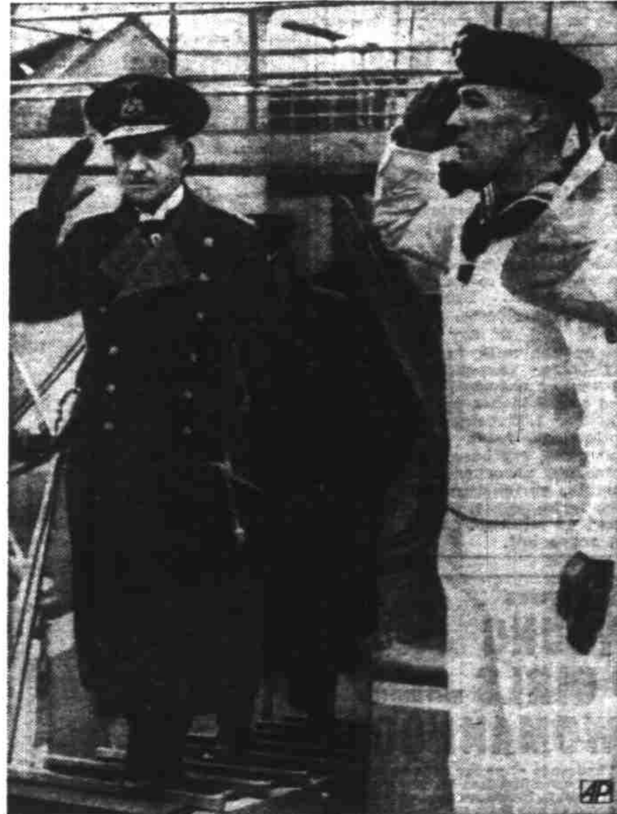
RAEDER CHECKS UP —Back of the Nazis' strategic maneuvering in the great tug-of-war for naval control between the Allies and Germany is the commander of the German navy, Admiral Erich Raeder, shown above after recent inspection of a Nazi naval vessel. Germany is using undersea craft as well as airplanes to cripple Allied shipping.