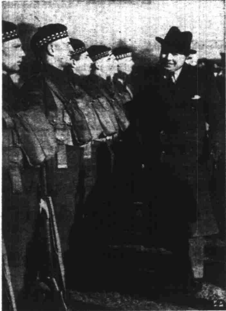
CAUSE OF STORM —When this picture of his inspection of Canadian troops in England was taken in late December, Leslie Hore-Belisha (right) had no hint of his later dismissal as British war secretary, which aroused loud protest.