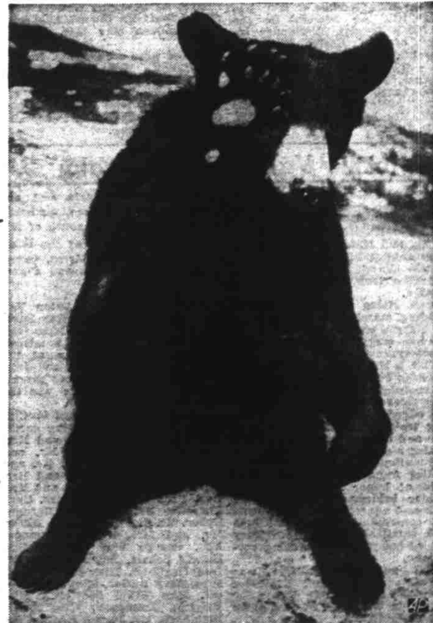
NOT THE RUSSIAN BEAR —Two lumps of sugar is twice asked by this bear for giving Nazi salute at Sydney, N.S.W.