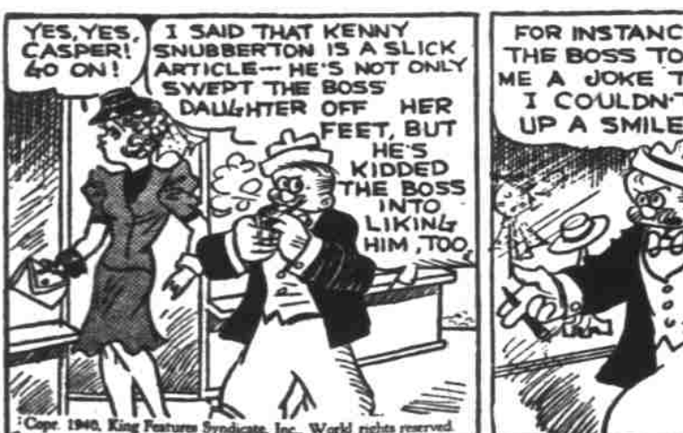
THIMBLE THEATRE—Starring Popeye