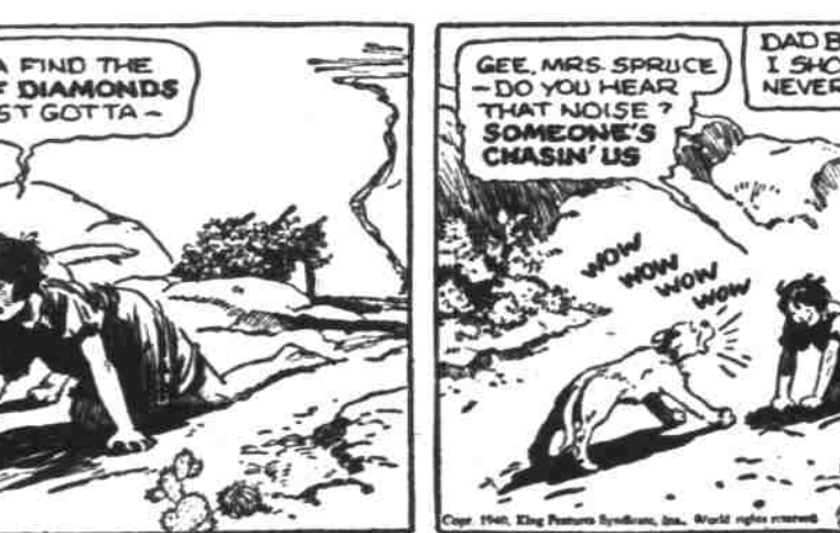
Toots Has a "Buy" Word