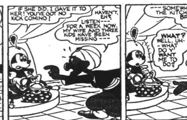
The Constant Beast