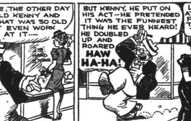
The Dove of Peace Goes Coo-coo