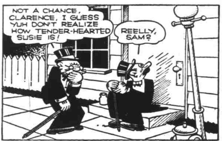
The Wide and Open Spaces