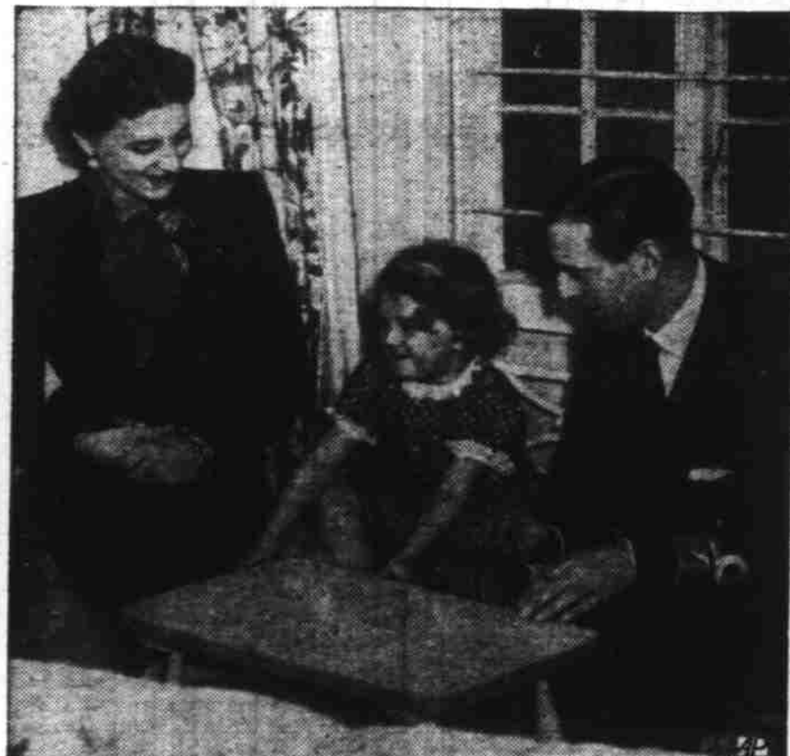
THE DUKE CALLS —On short leave from service with Britain's navy, the Duke of Kent visited the duchess and their children, Prince Edward and Princess Alexandra (shown). The royal family is living in the west of England.