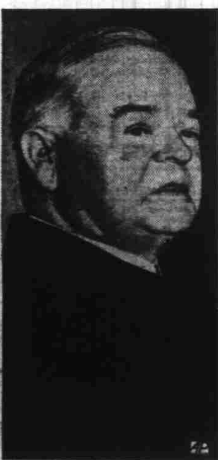
RELIEF JOB —Former President Herbert Hoover is shown in New York on his arrival to direct the organization of a Finnish relief campaign. He disclaimed any friction between his and other groups organizing relief for Finland.