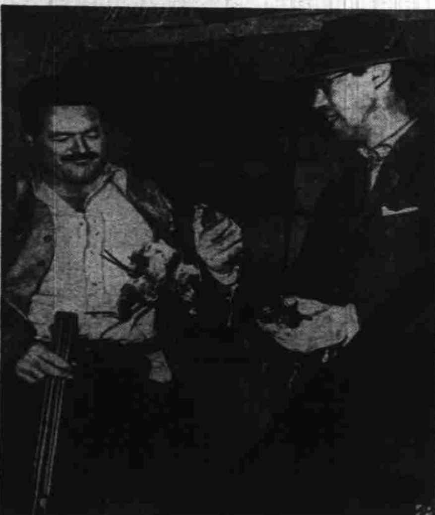
THEY GOT THE BIRD(S) —Shyness seemed to overcome Novelist Ernest Hemingway (left) when he and Christopher LaFarge, author and poet, posed at Sun Valley, Idaho, with their day's catch of snipe, fast-flying game bird.