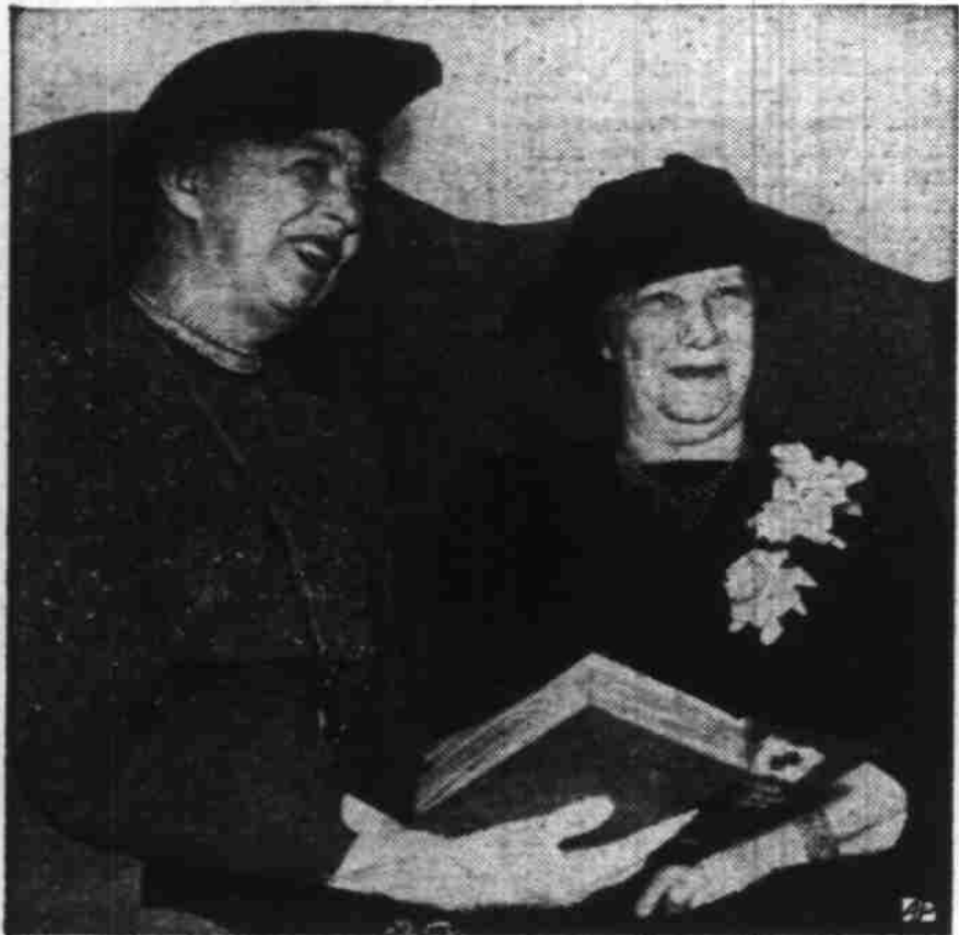
WOMEN'S WORLD —Two callers at world center for women's archives in capital recently were Mrs. Franklin D. Roosevelt (left) and Dr. Mary Beard, historian and author. Dr. Beard is founder of the archives center.