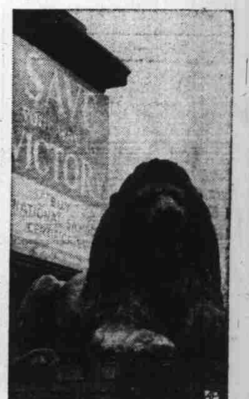
LION'S SHARE —Eloquent salesman in London's famous Trafalgar Square is this lion, one of four at the foot of the Lord Nelson column. The sign urges Britons to put their money into certificates for the national defense fund.