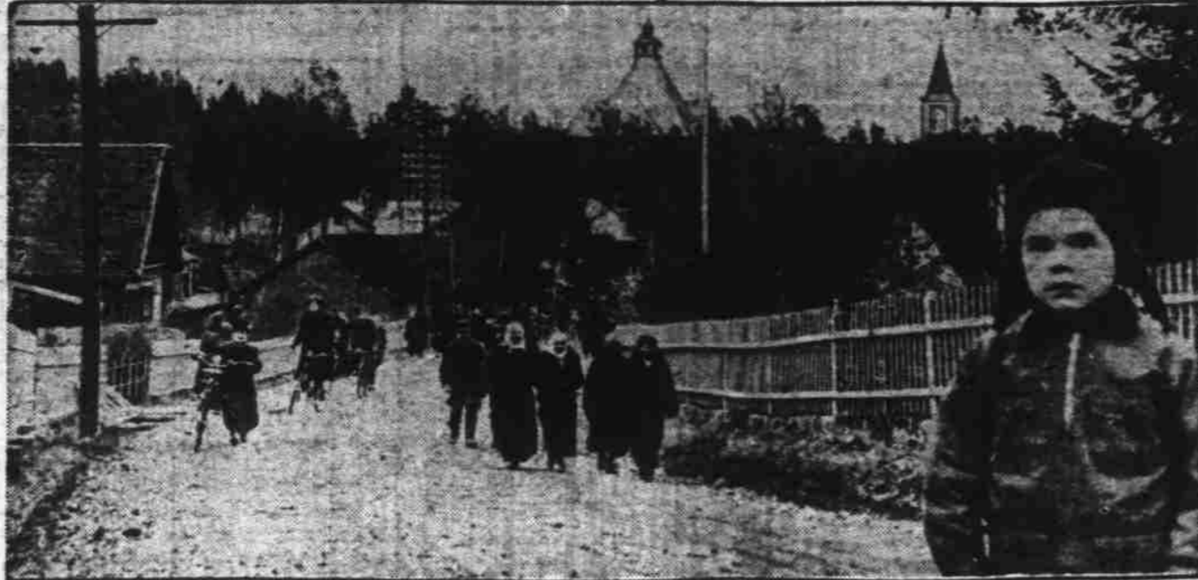
A surprise attack by Finnish airplanes on the soviet's northern air base at Murmansk, which destroyed 60 Russian planes by means of incendiary bombs, was reported December 5, as Finns continued a defense against mighty Russian armies and air force. Meantime, scores of southern villages as well as Helsinki, capital city, were being evacuated. Photo shows lines of women and children leaving the town of Trijoki, in path of Russia's mobile force.