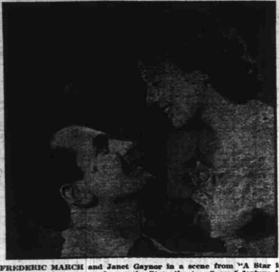
FREDERIC MARCH and Janet Gaynor in a scene from "A Star is Born," which opens today at the State theatre. Second feature is "It Could Happen to You" with Stuart Erwin and Gloria Stuart.