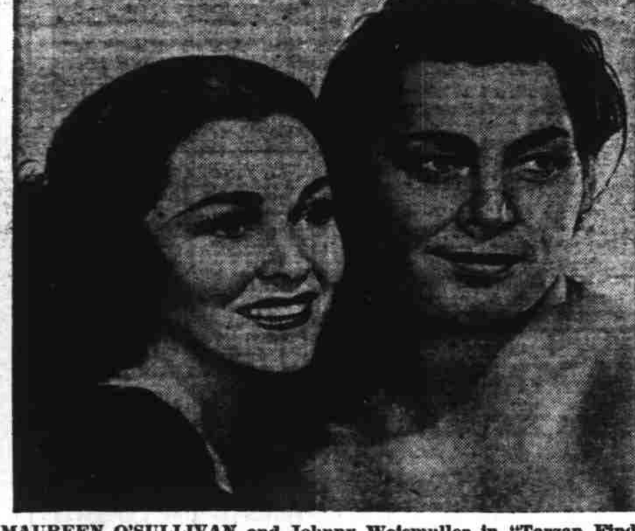
MAUREEN O'SULLIVAN and Johnny Weismuller in "Tarzan Finds a Son," now showing at the Hollywood theatre.