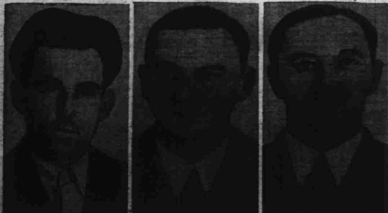
George Elser of Munich, pictured left, confessed upon arrest that he planted the time bomb which blasted Munich's Nazi beer hall during November 8 in a bold attempt to assassinate Adolf Hitler and chief aides, according to Richard Himmler, Nazi secret police head. Held also were two purported British agents taken into custody by the Gestapo. Pictured above, they were identified simply as "Mr. Best" and "Captain Stevens," supposed to have worked with one-time Nazi leader Otto Stumpfer, now called in Switzerland. Stumpfer denied knowing the men.