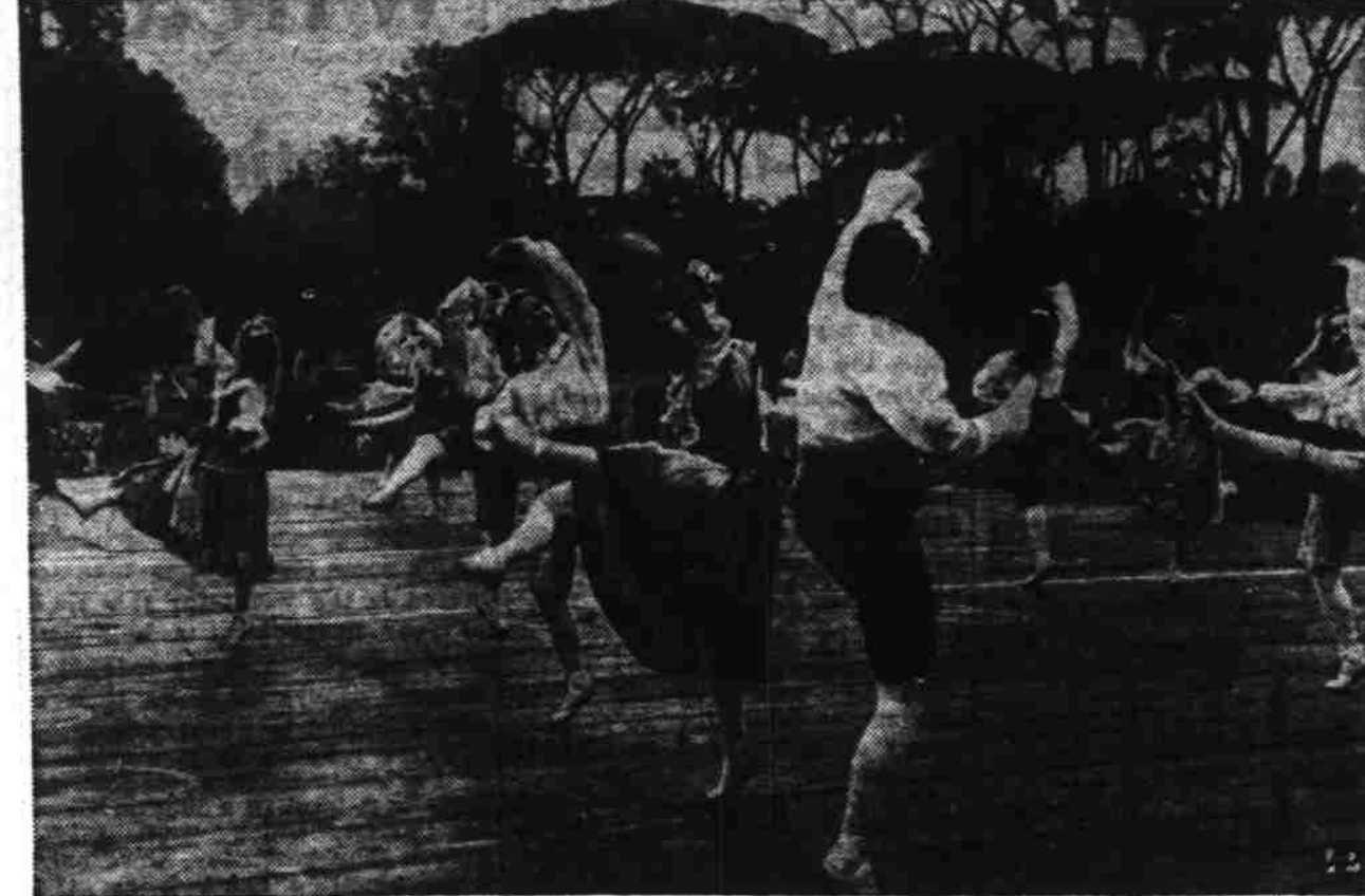
Europe's war didn't interfere with the gay "feast of the grapes" at Rome, Italy, where Italian dancers help celebrate a successful harvest.