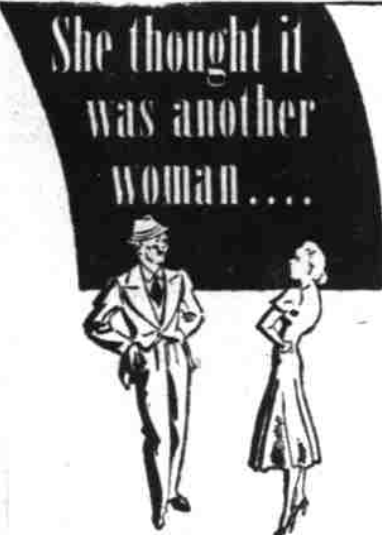
She thought it was another woman....