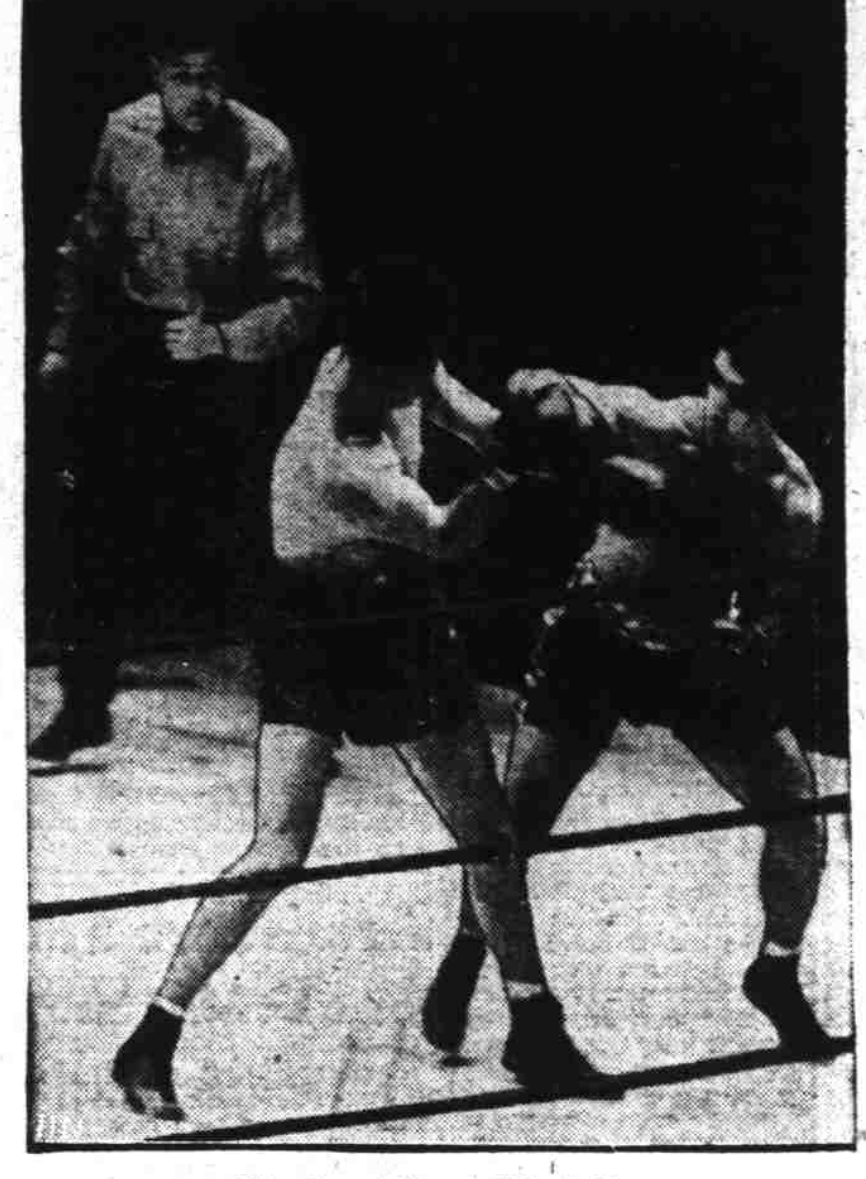
Billy Conn, left, and Melio Bettina Action from the Billy Conn-Melio Bettina light heavyweight championship bout in Pittsburgh won by Conn in 15 rounds. A late rally helped the Pittsburgh Irishman retain the crown he won from Bettina last July. A crowd of 18,000 saw the bout.