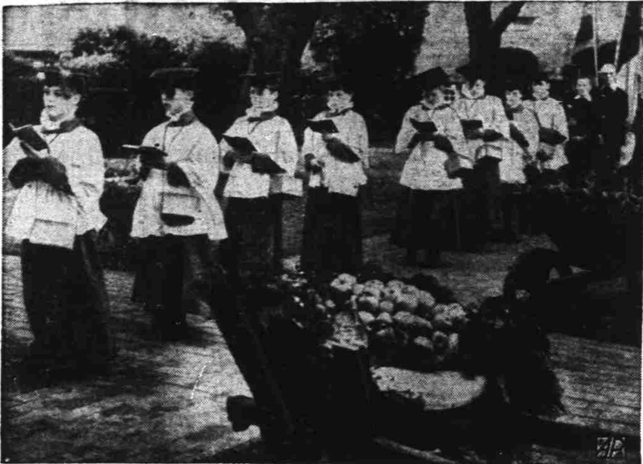
Because a hymn of hate also is being sung—on the war front—these English choir boys carried their gas mask containers as they sang at the annual harvest festival service at Challey Heritage Home for Cripples in London.