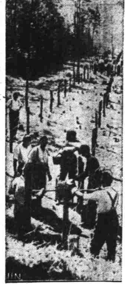
Sharing the fear of the Allied general staff that German forces may use Switzerland as a back door to France, the Swiss are taking precautions to safeguard their frontiers. This barbed wire fence is going up in a forest clearing near Berne.