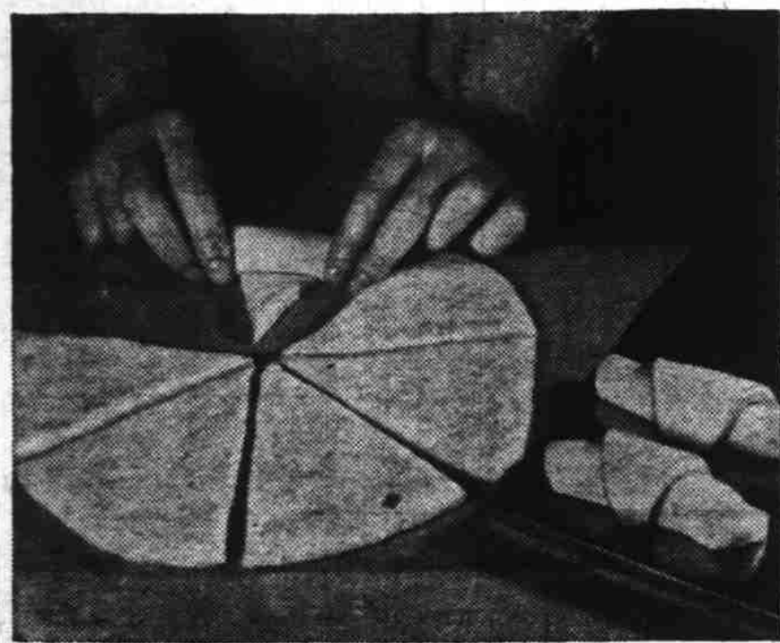
SIMPLE TWIST—The picture tells the story of how to form your favorite rich yeast dough into those attractive little crescent rolls so admired. After they are rolled like this, curve in to a crescent shape and let rise before baking.

The Alpha Psi Delta fraternity at Willamette university entertained with an informal evening of dancing at the chapter house Saturday night.