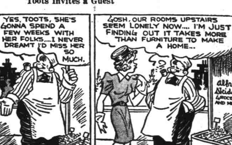
Toots Invites a Guest