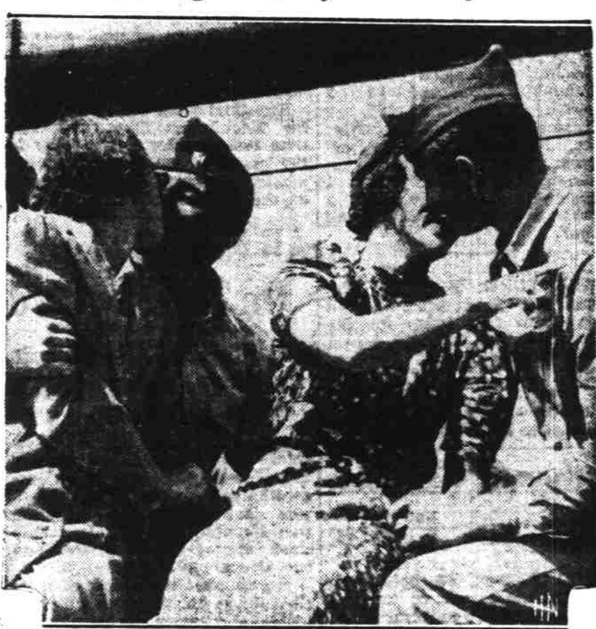
'Tis farewell for the nonce as anti-aircraft gunners attached to the 62nd Coast Artillery, kiss their girls goodbye before boarding the U. S. army transport St. Michel at New York. They are bound for the Panama Canal Zone, where Uncle Sam is bolstering the defenses of his east-west lifeline.