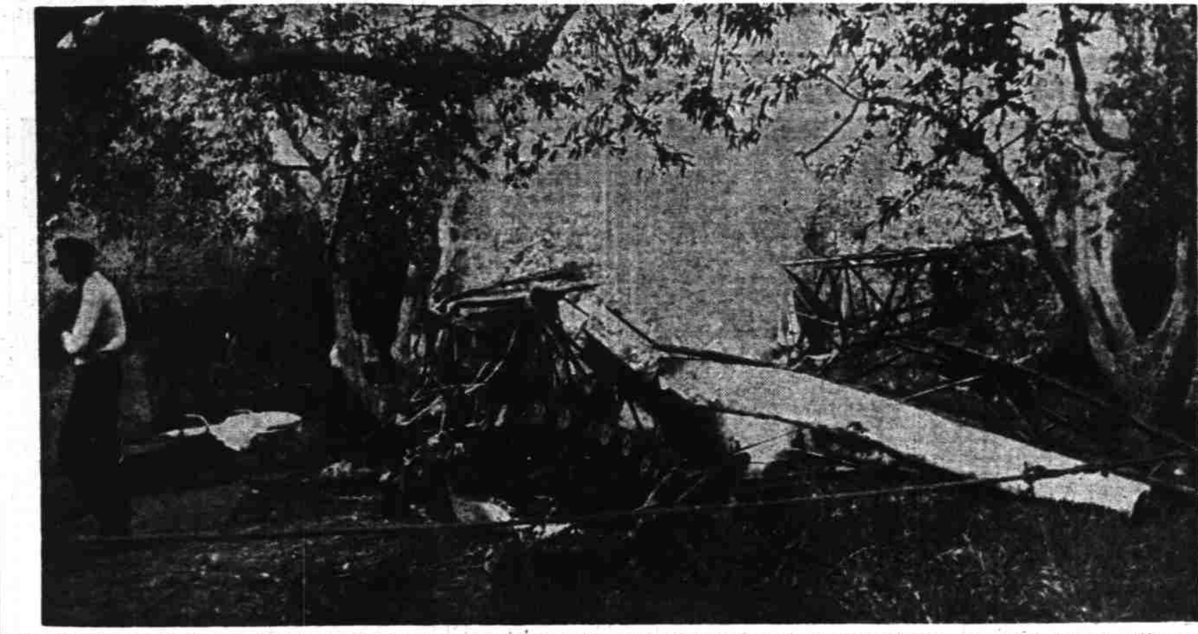
Four persons, including the pilot, lost their lives in the flaming wreckage of the plane seen in the photo above. Two others miraculously escaped with painful injuries. The crash occurred in an orchard near the Yakima airport last Sunday. Coroner's representatives were forced to cut away the metal framework in order to extricate the charred bodies.