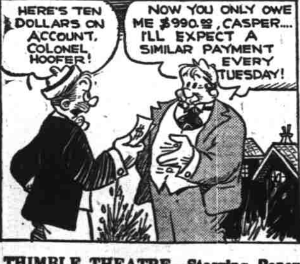
THIMBLE THEATRE-Starring Popeye