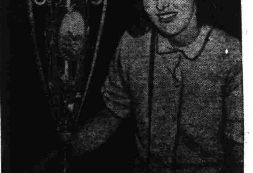
Betty Jameson with cup. New ruler of the feminine golf brigade in the United States, Betty Jameson, 30, of San Antonio, Tex., is pictured with her trophy following victory in the tourney held at Noroton, Conn. Patty Berg, the defending champion, did not compete because of a recent operation.

LEGAL NOTICE NOTICE OF APPOINTMENT OF EXECUTOR IN THE COUNTY COURT OF THE STATE OF OREGON FOR THE COUNTY OF MARION, No. 10182.