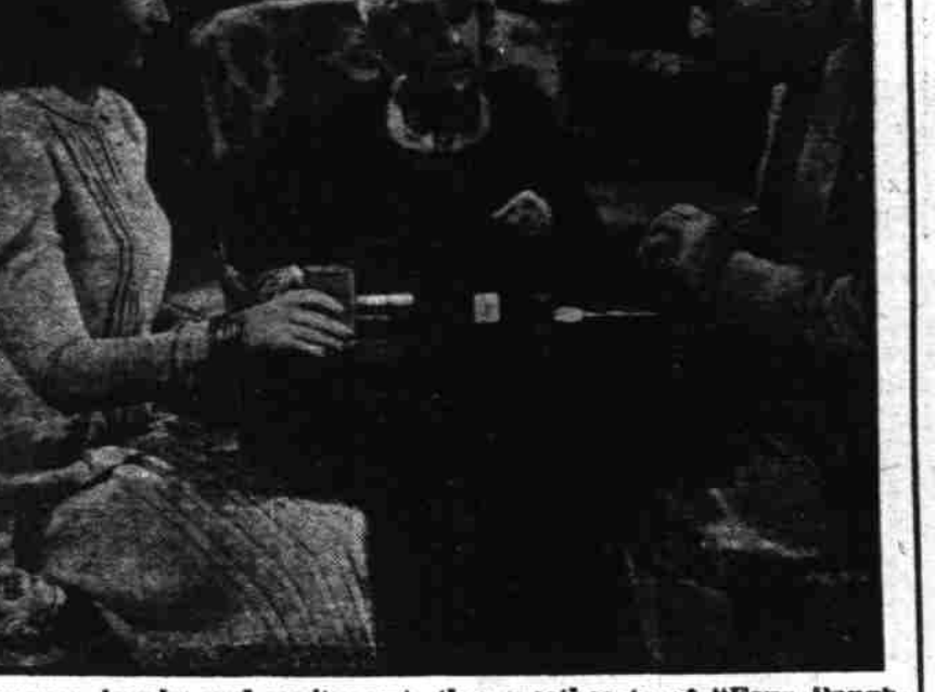
Romance, laughs and excitement, the sweethearts of "Four Daughters," Priscilla Lane and Jeffrey Lynn, star in the Broadway hit, "Yes My Darling Daughter." Co-starred with Miss Lane and Lynn are Roland "Toppers" Young, Fay Bainter, and the screen's "Lady for a Day" May Robson. Double-billed with "Yes My Darling Daughter" today through Thursday at the State theatre are James Cagney and Rosemary Lane in "The Oklahoma Kid."

LEGAL NOTICE NOTICE OF APPOINTMENT OF EXECUTOR IN THE COUNTY COURT OF THE STATE OF OREGON FOR THE COUNTY OF MARION, No. 10182.