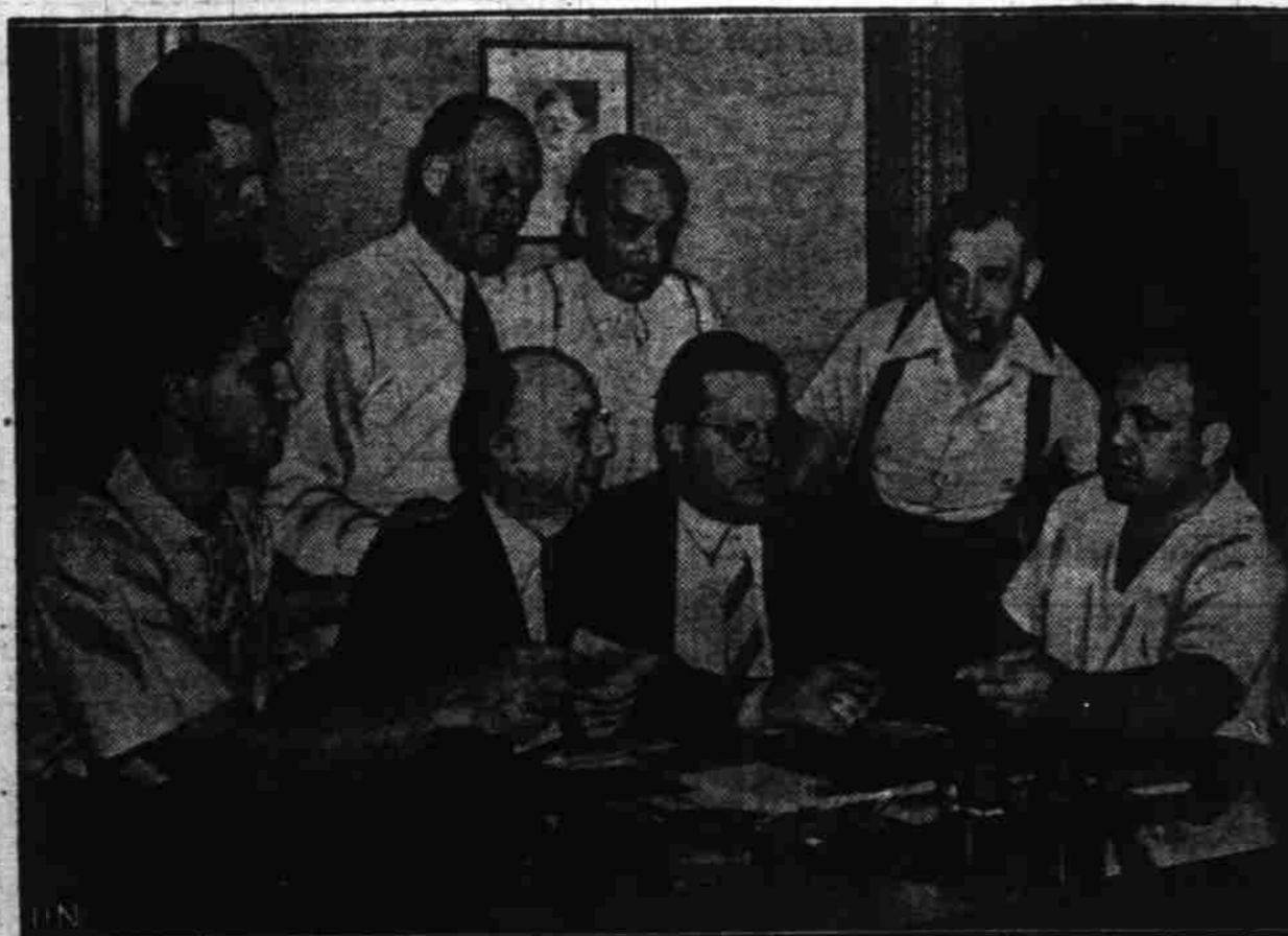
Galento, Nova post forfeits for coming bout