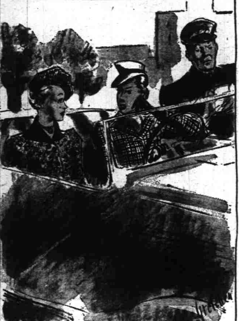
It just doesn't make sense to me. Thirty-five miles an hour speed limit and one hundred mile an hour cars!