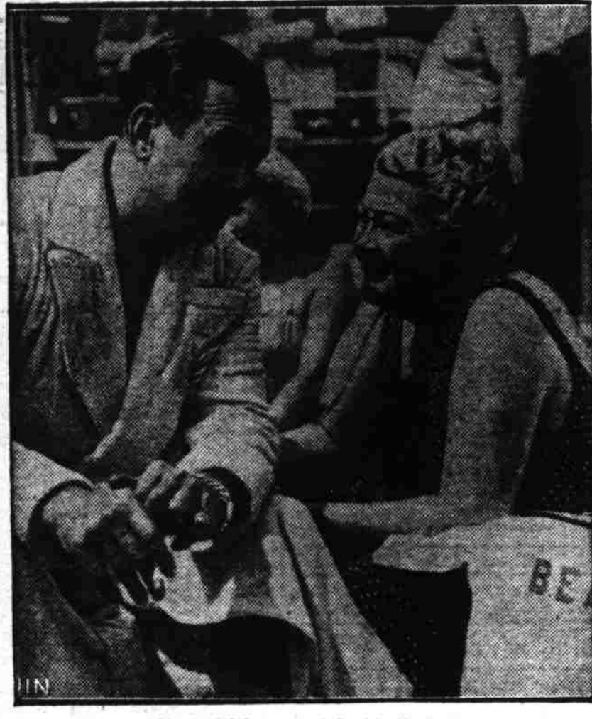
Harry Richman and Sophie Tucker