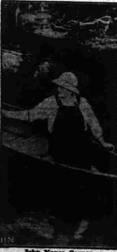
John Nance Garner

Away from drinking, crime and night life, Gov. Laren Dickinson, crusading chief executive of Michigan, spends a quiet vacation fishing near Kalamazoo, Mich.