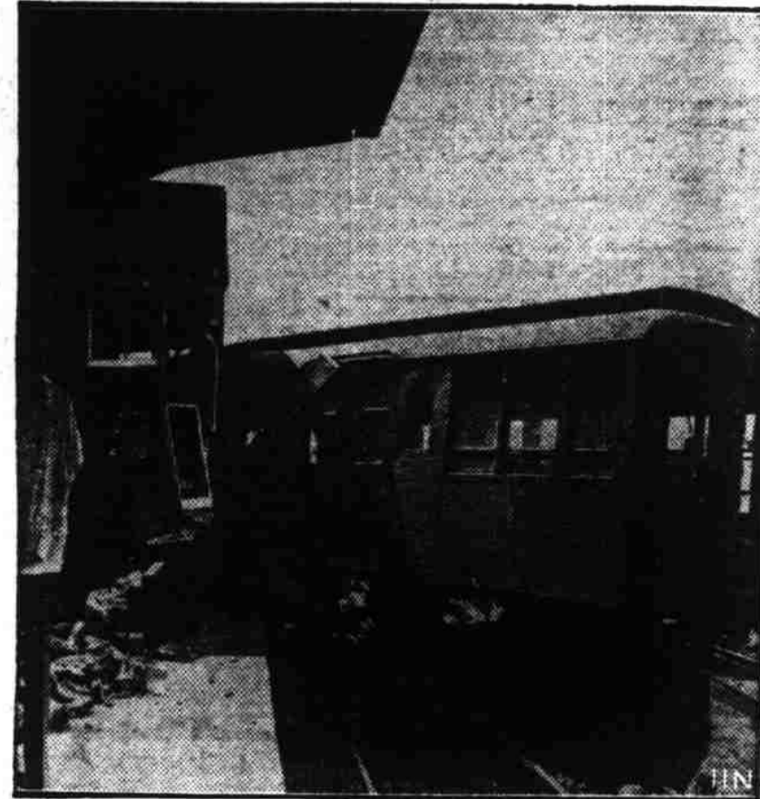
How "L" train crashed into tower

Mrs. Sarah Palfrey Fabyan's form is a thing of grace and beauty, coupled with workmanlike efficiency, as she makes a shot during Eastern grass courts championships at Rye, N. Y. Former champion Helen Wills Moody once predicted that Mrs. Fabyan would win the national title.