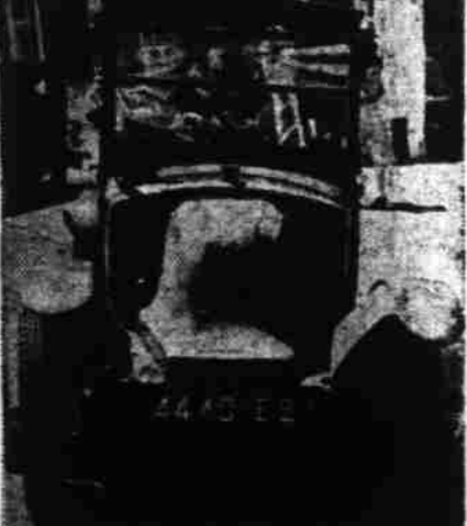
This battered old French taxicab, presumably one of those in which the historic "taxicab" army advanced on the Marne to repulse the Germans and save Paris, was one of the odd vehicles on Salem streets during the convention.