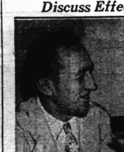
Senator Carl Hatch and John Nance Garner

Attorney General Frank Murphy has accepted responsibility for enforcement of the new Hatch law curbing political activities of most federal employes. While he told a press conference that a citizen was entitled to complain to the justice department against alleged violations of the statute, the author of the bill, Senator Carl Hatch, of New Mexico, left, was caught by the camera talking with Vice President John Nance Garner in the capital.