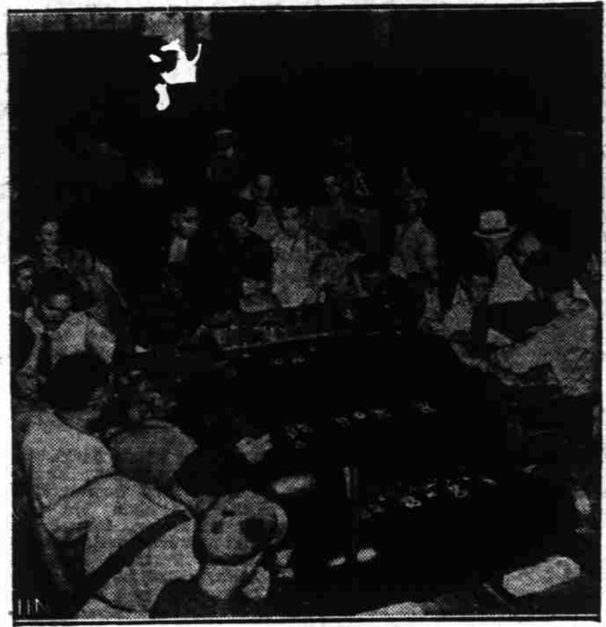
Bomb exhibition at Mitchell Field, N. Y. Eager youngsters among others crowd about demolition bombs ranging from 100 pounds to 2,000 pounds on exhibition at Mitchell Field, N. Y., as part of the 30th anniversary celebration of the U. S. army air corps. Meanwhile, army bombers staged shows for thousands of visitors at air bases throughout the U. S.