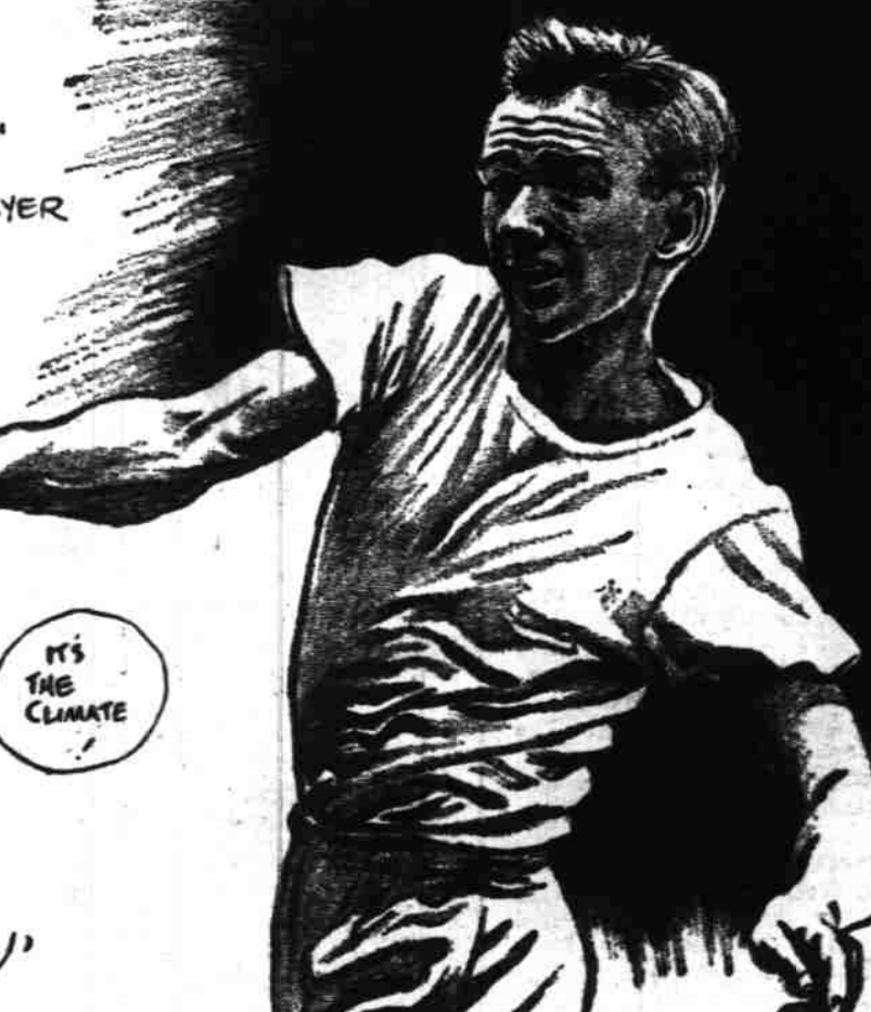
IT'S THE CLIMATE