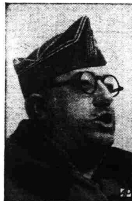
CRISIS? —Franco's demotion of Gen. Yague (above) may portend a fight for control of Spain between the monarchists-Carlists Yague favors and dictator-Fascists.