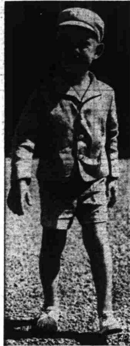
HEIR —One of America's richest youngsters, William Astor strides about Newport, R. I., estate of his father, John Jacob Astor. Young Bill is four years old—and sturdy.