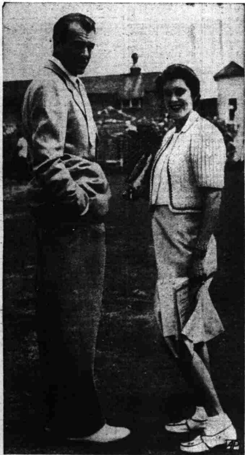
'DOC' AT DOG SHOW —Movie Star Gary Cooper and his socially prominent wife, Sandra Shaw, are seen attending the Southampton Kennel club show at Southampton. The Coopers are spending the summer season on Long Island, N. Y.