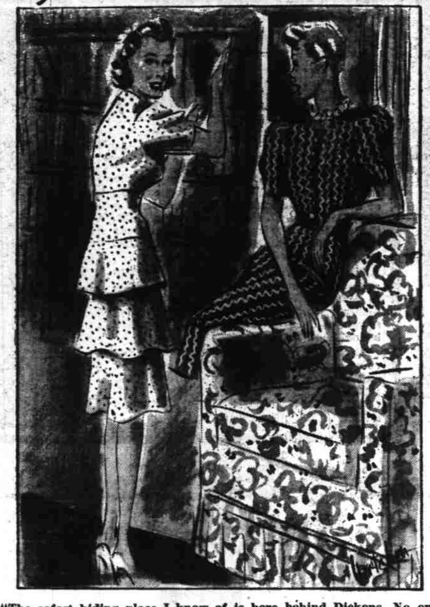
"The safest hiding place I know of is here behind Dickens. No on looks there until Christmas!"

Christmas seems very far away these dog days, but a lady can look well in the dress at left. The three-tiered skirt, fitted waist section and full bodice are grand for slender figures. The blonde displays an interesting print: white wavy stripes over a green background. A collar-less neckline sets off her heavy white jewelry. White pearl buttons trim the bodice closing.