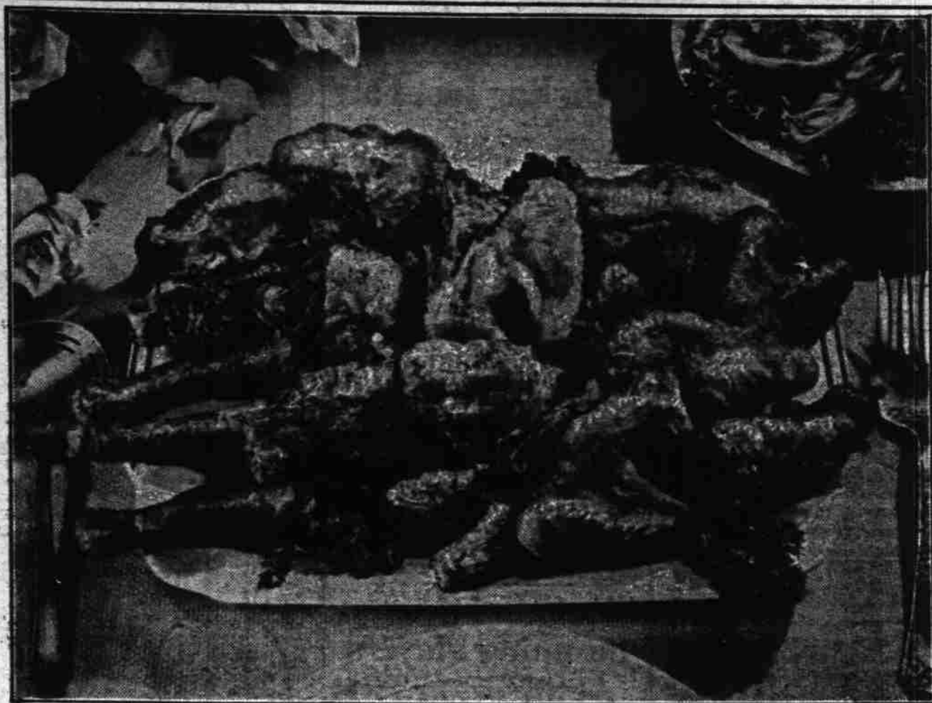
Some like it hot, some like it cold. But 'most everyone likes fried chicken. Here we have a platter of batter-dipped sectioned chicken (good old family style) fried until crunchy brown outside as suggested by Martha Logan. A period of slow cooking in the skillet or in a pan in the oven follows, to cook thoroughly every piece to that juicy, succulent stage known as perfection.