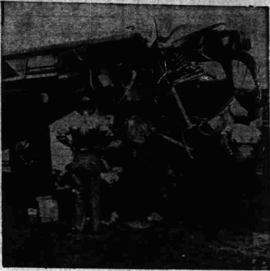
This is what remains of Greyhound bus after it crashed into rear of another Greyhound bus near Flagstaff, Ariz., killing driver of the rear bus and injuring 24 passengers. Both were eastbound. Crash occurred when first bus stopped 25 miles west of Flagstaff to pick up passengers.