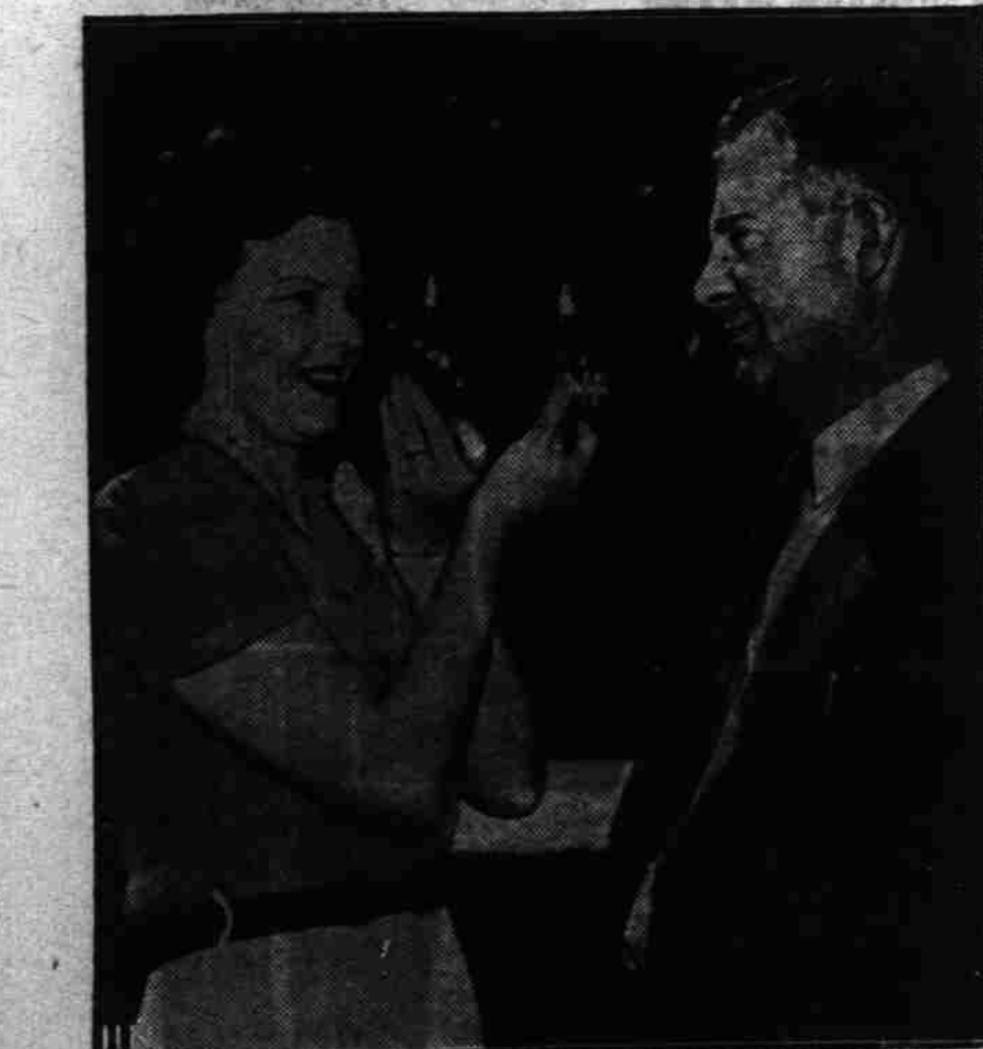
Here is the new first family of Louisiana, Earl K. Long and his wife. Long took over the governor's chair after resignation of Governor Richard Leche as a scandal involving embezzlement of university funds mounted.