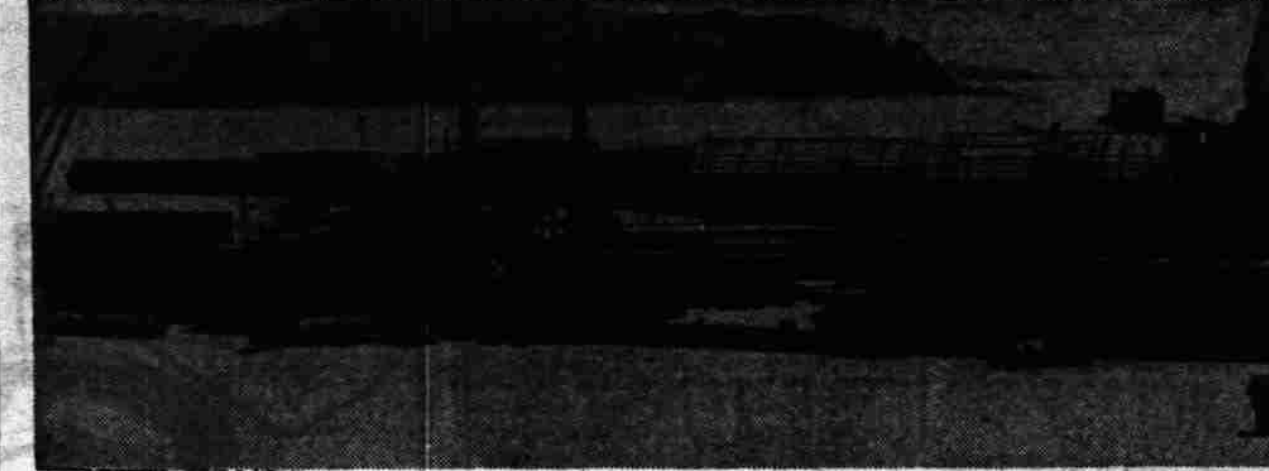
Coast defenses in the region of San Francisco bay were strengthened recently with the arrival of one of the world's largest and most modern weapons, a 100-ton, 16-inch long range gun. It has an accurate firing range of 26 miles, will fire a 2,000 pound projectile. One of the twin weapons making up the Townsey battery at Fort Cronkite, guardian of the Golden Gate's north shore, it is shown being unloaded from flat cars which transported it from the Waterville arsenal in Maryland.