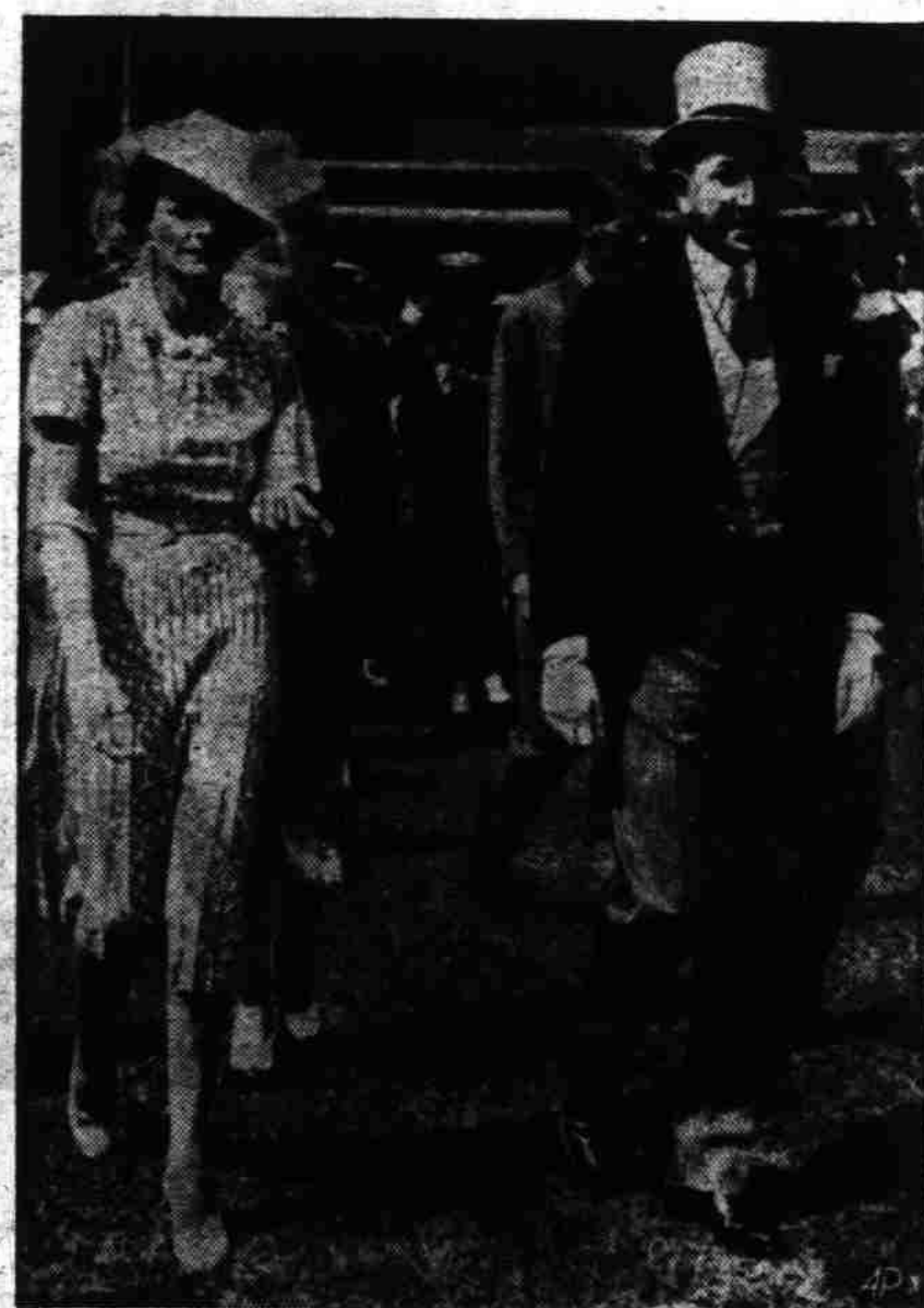
BRITISH FASHION PLATE —Arrival of Noel Coward, English playwright and occasional composer, created a stir at a theatrical garden party near London. His companion is Lady Mountbatten. The party aided an actors' orphanage.