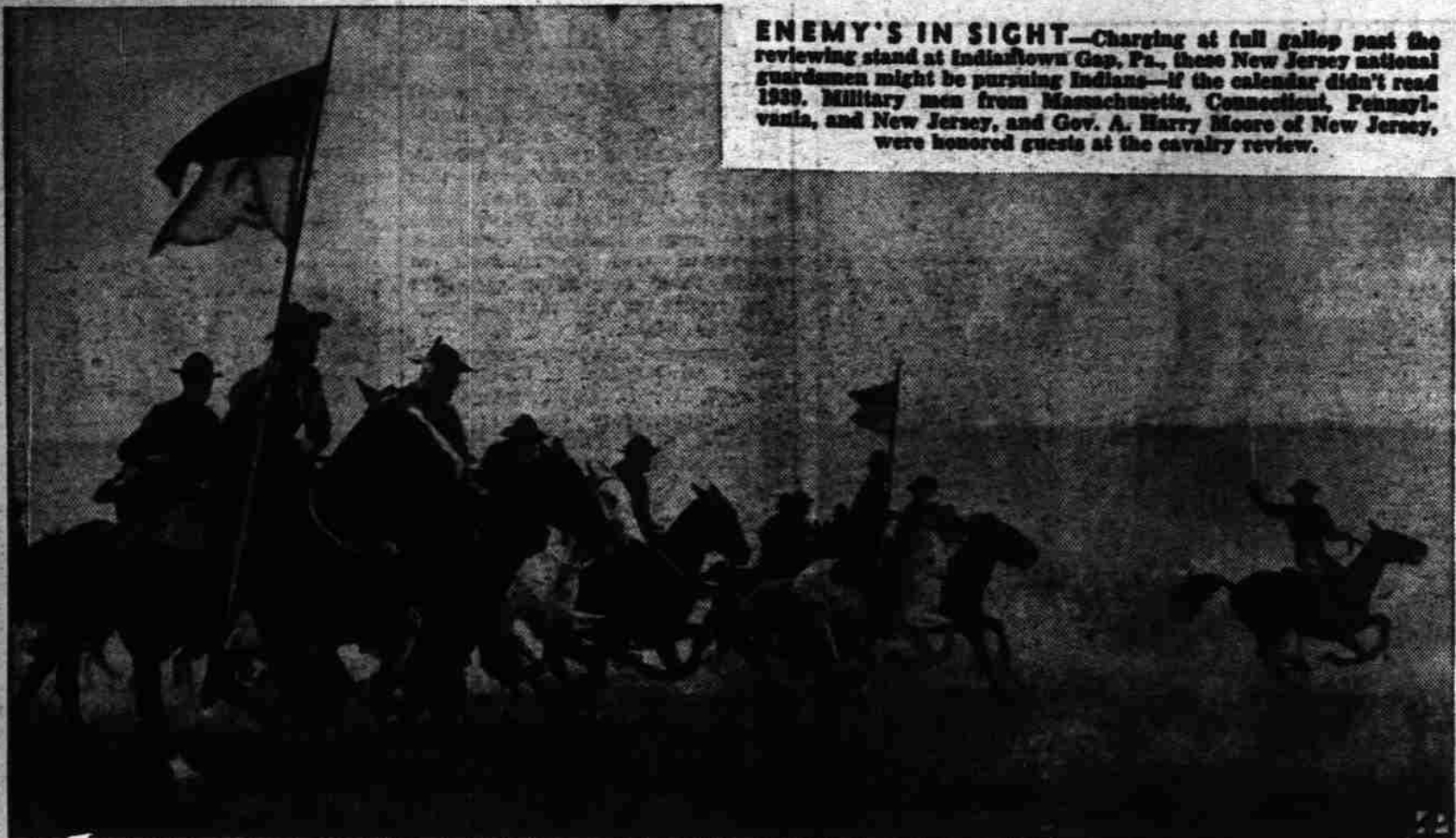
ENEMY'S IN SIGHT —Charging at full gallop past the reviewing stand at Indiantown Gap, Pa., these New Jersey national guardsmen might be pursuing Indians—if the calendar didn't read 1939. Military men from Massachusetts, Connecticut, Pennsylvania, and New Jersey, and Gov. A. Harry Moore of New Jersey, were honored guests at the cavalry review.