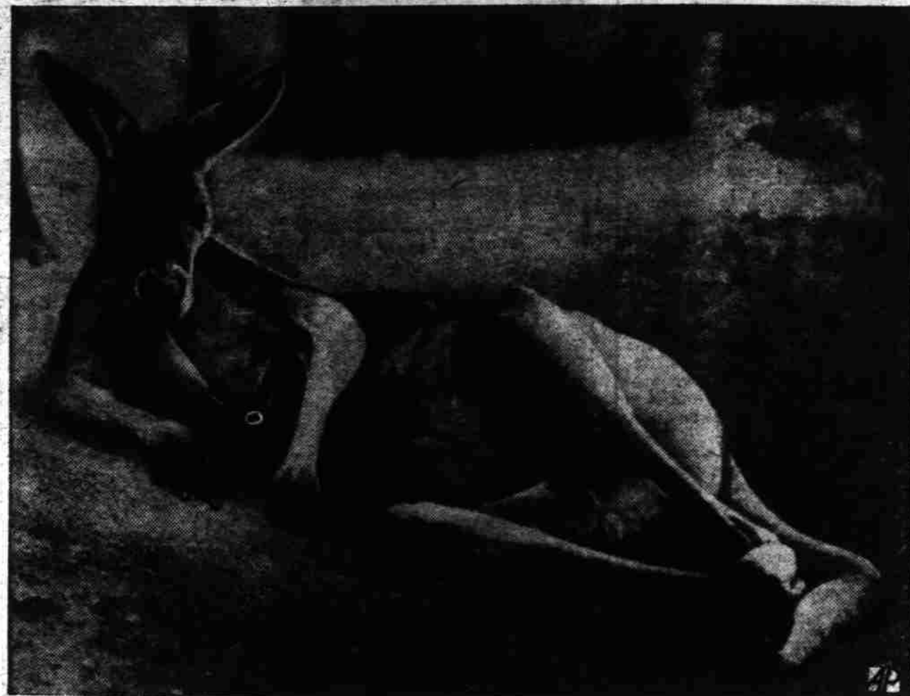
MUST BE THE 'MORNING AFTER' —There's nothing like 40 winks of sleep this recumbent kangaroo with a somewhat tipsy look seems to say, in the zoo at Sydney, Australia.