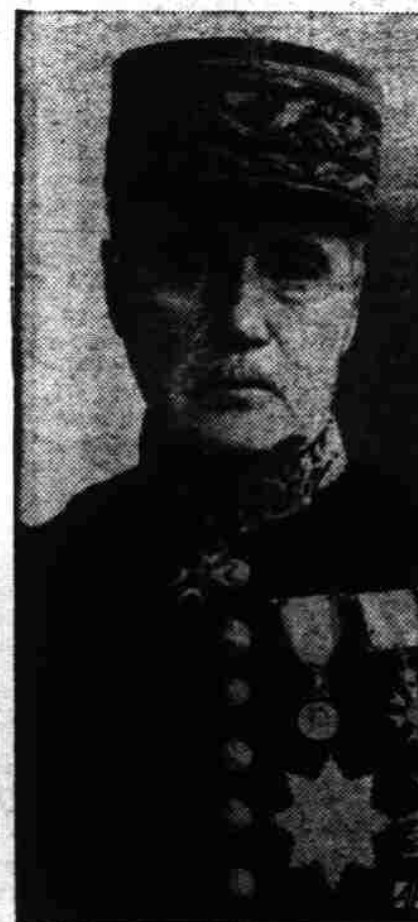
WELCOMED —Britain's most cordial welcome was given Gen. Maurice Gamelin (above), supreme commander of France's air, land and sea forces, who visited London recently.