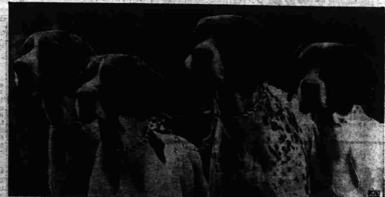
FOUR OF A KIND —A cameraman's visit helped relieve the tedium of waiting for judges, for these blue-blooded pointers at a Paris dog show in the Bois de Boulogne.