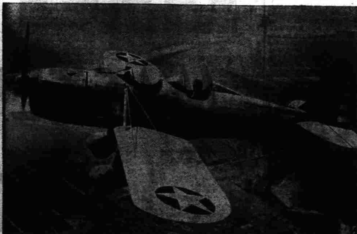
ONE OF THE EAGLE'S BROOD —This is one of the new primary training planes for the United States army air corps, being put through its paces over San Diego, Cal. The ship, known as the Ryan XPT-16, will be used in the training of army pilots. A contract has been awarded for the low-wing, two-place monoplane driven by a 225-horsepower engine.