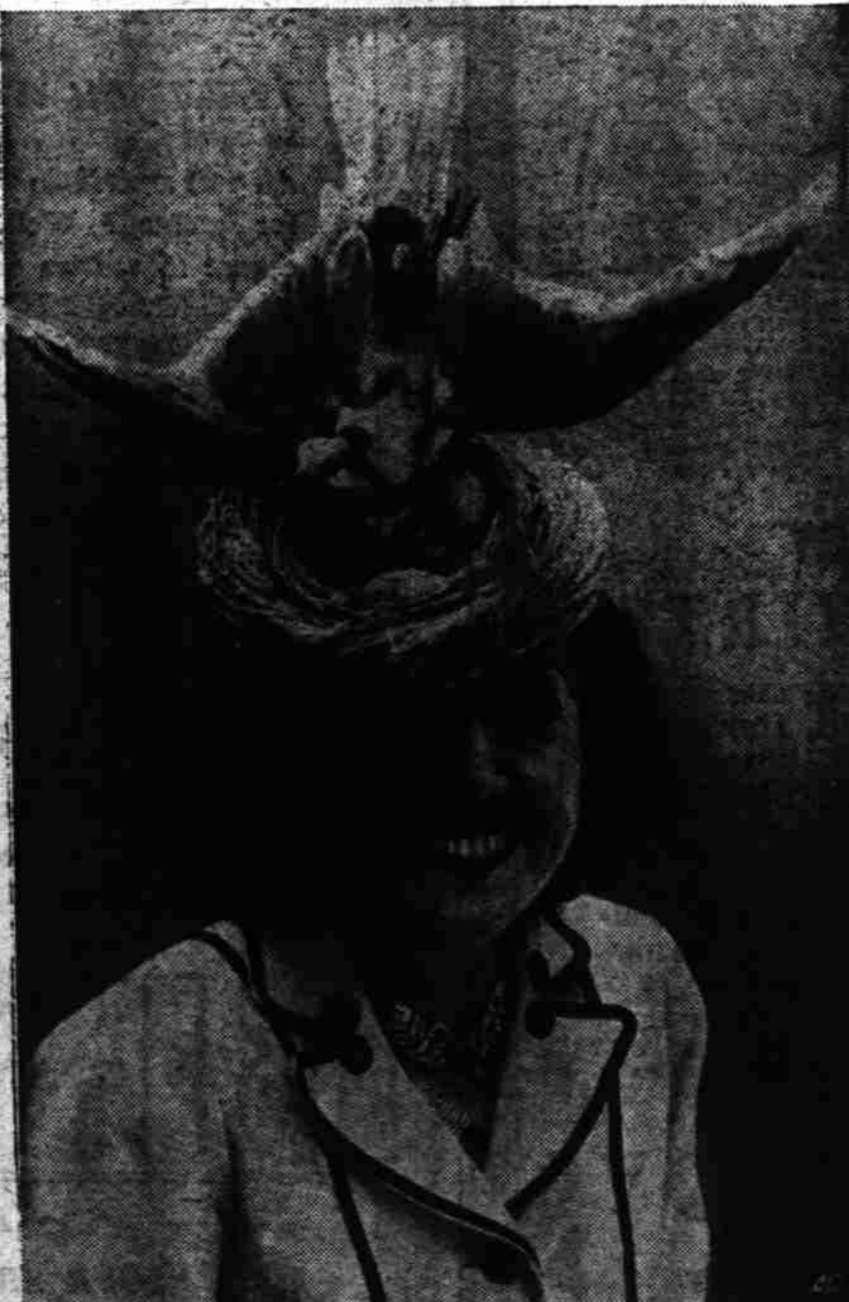
IT GOT THE BIRD! —Don't look now, but if this cheep from any Paris is any hint of what's to come this fall, hats may be funnier. The bonnet, complete with dove and three eggs, won a prize at a contest in the Bois de Boulogne.