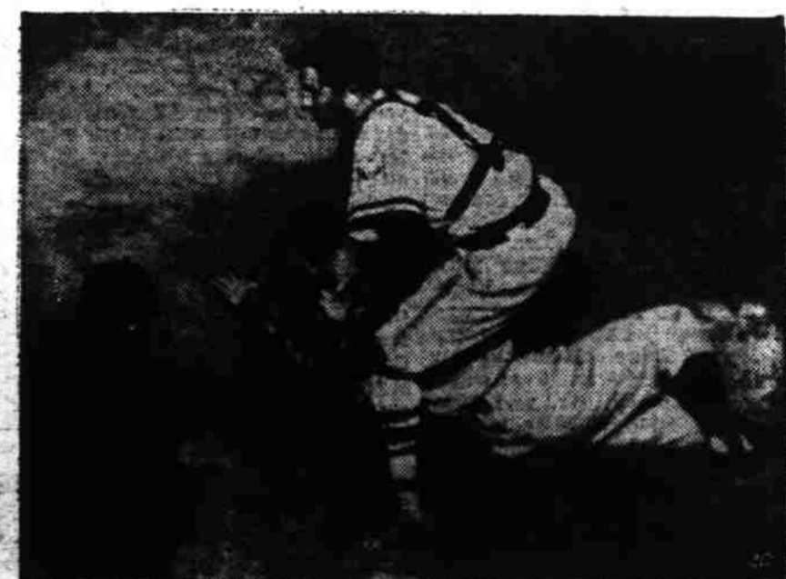
MUST BE 'PIGGY-BACK' —There wasn't room for the umpire who stood off to one side, observing this play in the Cincinnati Reds-Bees game at Boston. Boston Catcher Lopez is putting the ball on Reds' Fielder Craft, who slid over home plate.