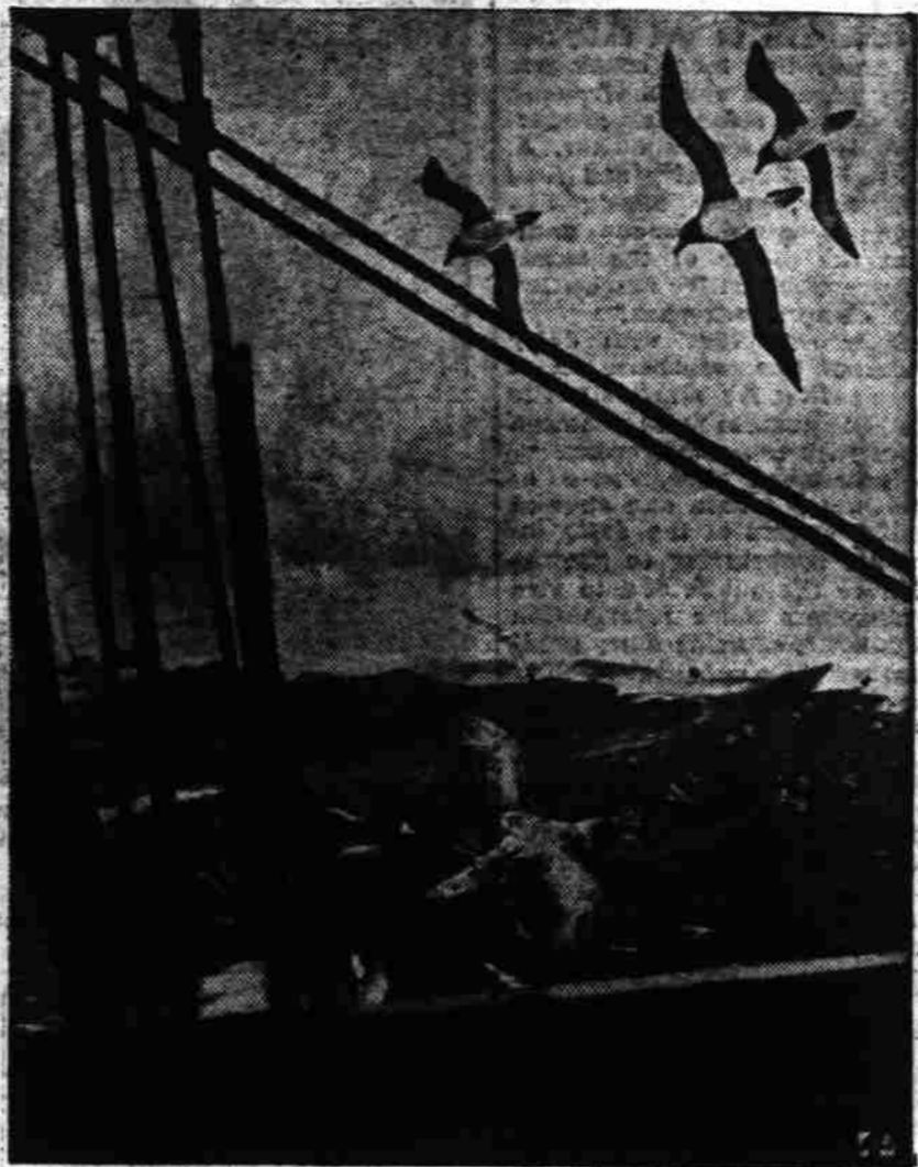
DOWN TO THE SEA —These two great wanderers of the ocean, the petrel and albatross, dip into the waves in above "Ship-Followers" group at the new $1,500,000 Whitney wing of the American Museum of Natural History in New York. The grouping represents a spot in the ocean southeast of New Zealand as seen from the France, the Whitney South Sea expedition schooner, which served the museum for ten years.