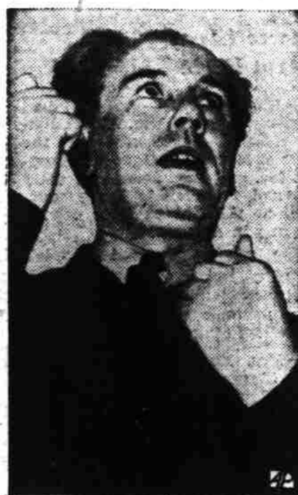
IRISHMAN —Possible attempt by Britain to extradite Sean Russell (above), leader of the outlawed Irish Republican Army, has been rumored in California, where Russell lives. I.R.A. has been blamed for recent bomb outrages in England.