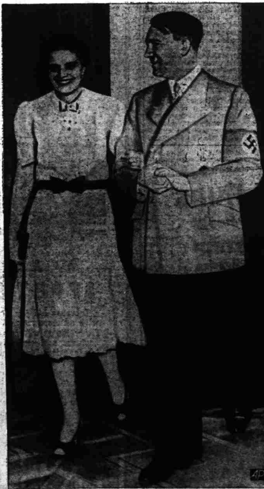
LADIES' MAN? —To a world accustomed to seeing him in military poses, Germany's Adolf Hitler showed off a more gentlemanly side at a recent Berlin reception. Here's Der Fuehrer escorting the wife of Italian Ambassador Bernardo Attolico into the room. He's wearing his new white uniform dinner jacket for the first time. The party honored Italy's Count Ciano.