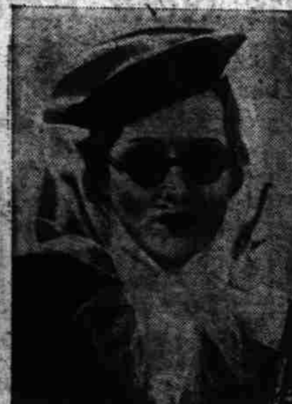
FROTH —This gossamer number appeared, with its wearer, on the fashionable fields at England's race track, Epsom.