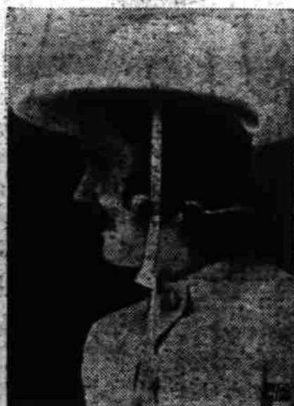
HYBRID —Viewed upside down, it might be a salad bowl. This British hat is a cross between a polo cap and shako.