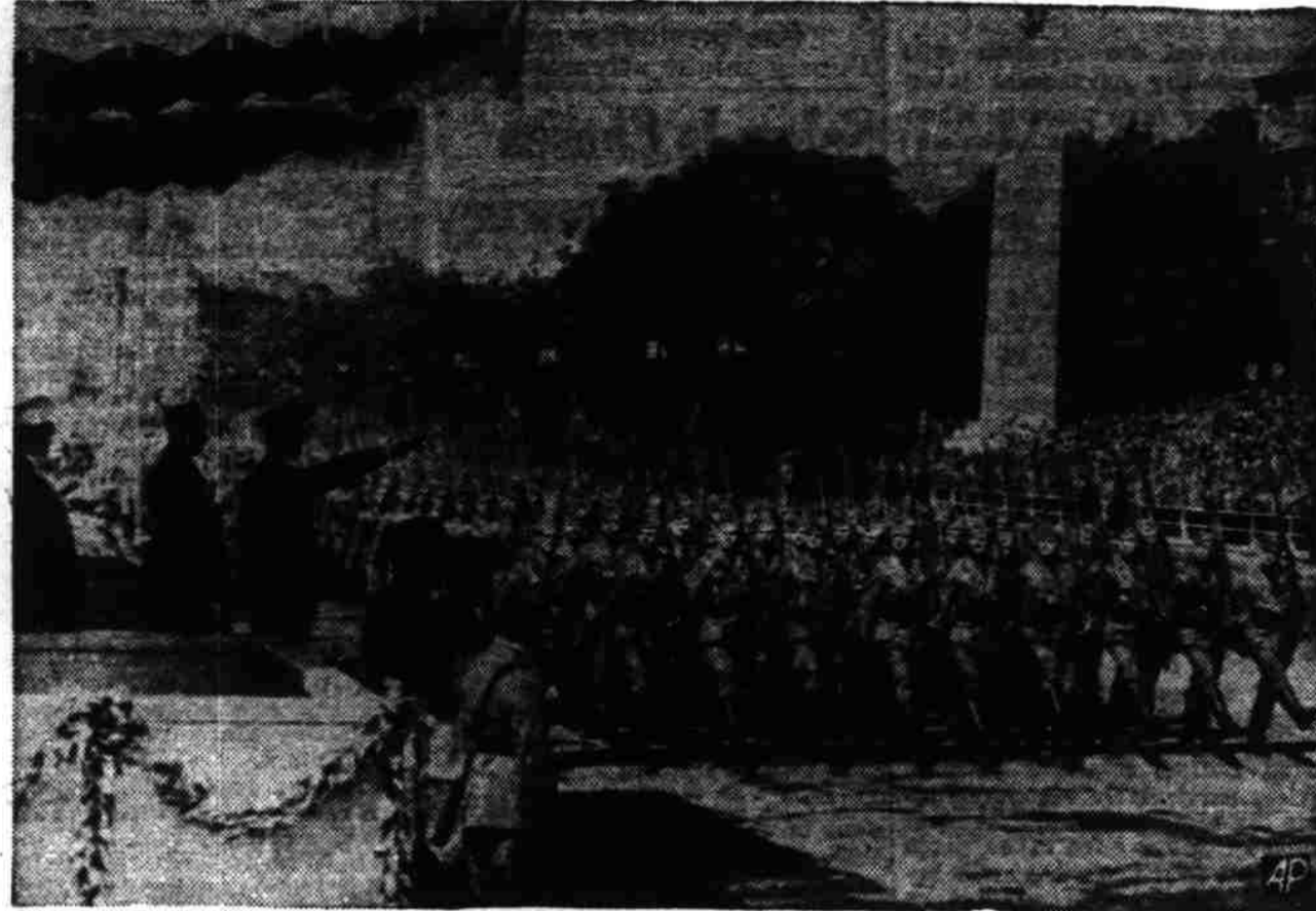
Reichschancellor Adolf Hitler is shown as he reviewed returning German troops which fought for France in the Spanish war as they marched through the streets of Berlin. The soldiers are members of the German Condor Legion.