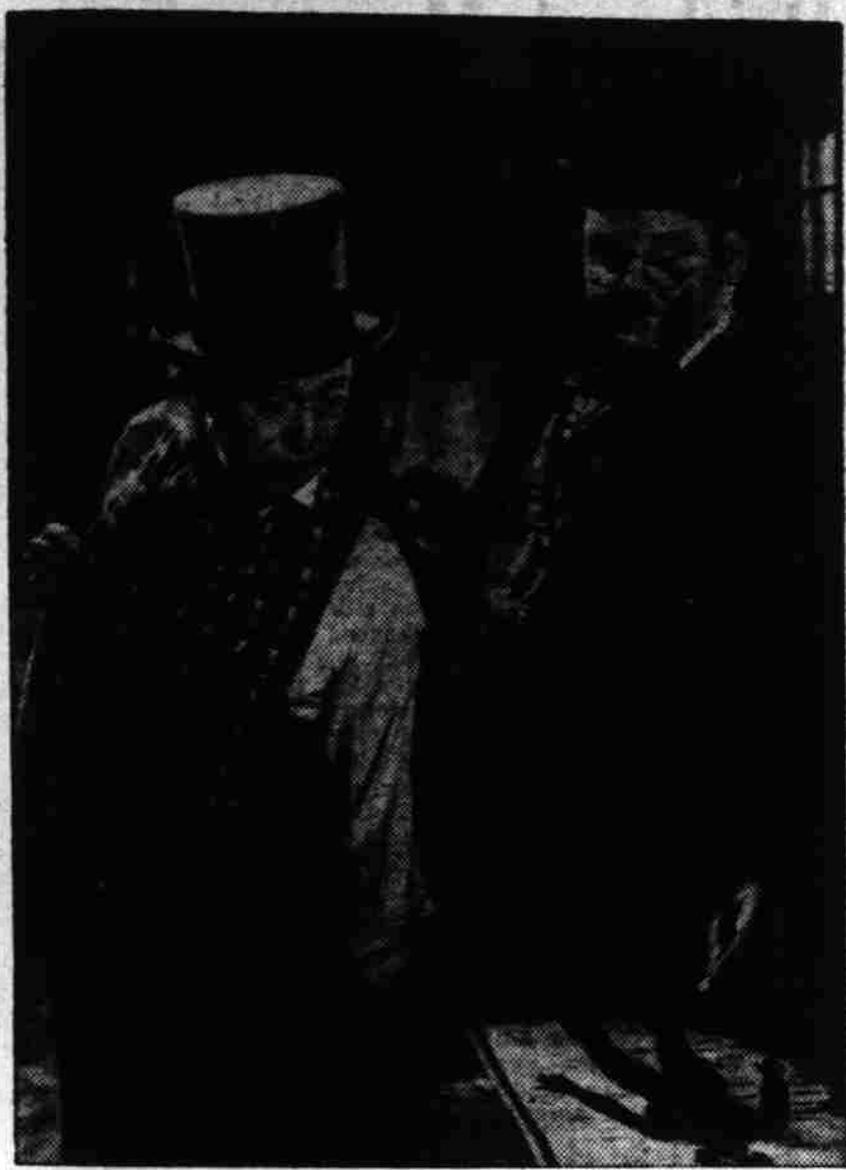
Oliver Hardy and Harry Langdon try to figure out some universal problems during the course of "Zenobia," the new Hal Roach comedy now playing at the Capitol theatre. Companion feature is "Boys Reformatory," with Frankie Darrow; also "The Lone Ranger Rides Again."