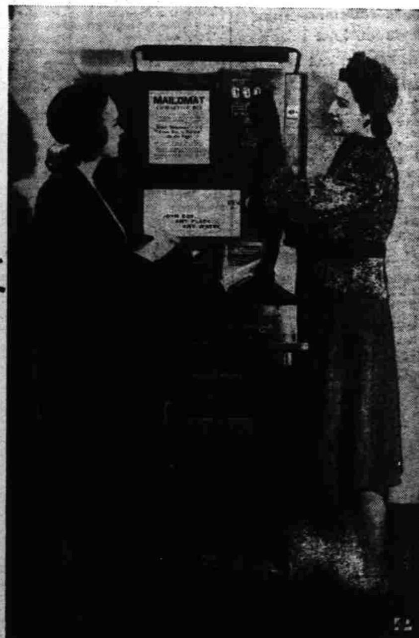
BUT IT WON'T WRITE that letter—this automatic device for stamping and mailing. Coins to cover postage are inserted, dials are turned to indicate stamp value, and machine prints meter stamp mark. "Malleomat" had its premiere in N. Y.