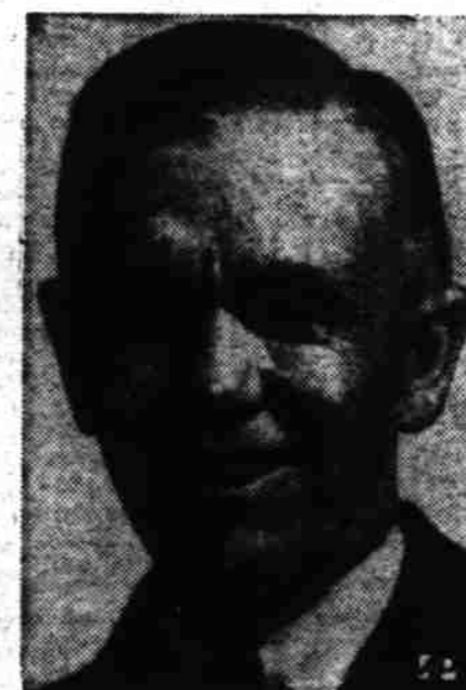
VISIT to Puerto Rico was among first official acts of Brig. Gen. George Marshall after choice as chief of staff.