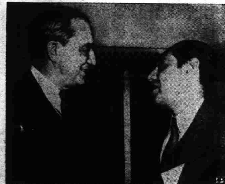
FRANK DISCUSSION about nation's financial structure followed meeting of Industrialist Owen Young (left) and Jerome Frank, newly-elected chairman of the Securities and Exchange commission, at monopoly hearing in Washington, D. C.