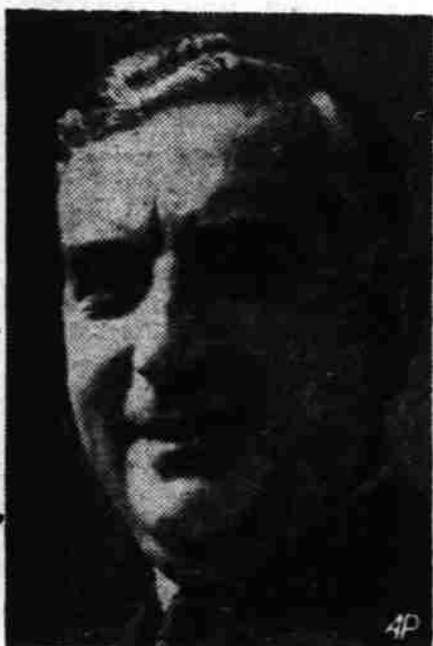
NEW PREMIER of Australia is Robert G. Menzies (above), 44, who recently said that the Australian government plans soon to establish legations in Washington and Tokyo.