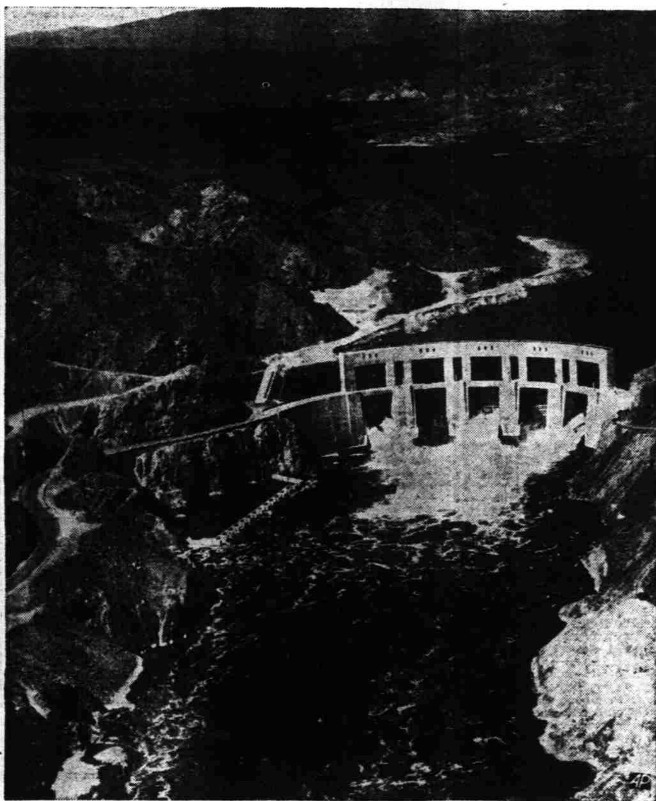
CALLED THE BEAUTY QUEEN AMONG DAMS , the 280-foot-high Parker dam on the Colorado river, 135 miles below Boulder dam, is shown above in a recent view. Two-thirds of its height is submerged. Parker is the diversion dam for the 242-mile aqueduct built to carry one billion gallons of water a day for the domestic needs of Los Angeles and 13 nearby cities.