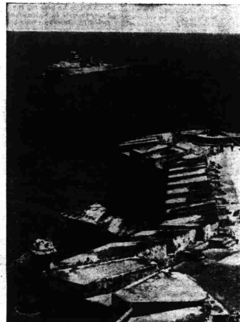
MORE HISTORY will be made on Puerto Rico. Uncle Sam's tropical isle on which above old fort, El Morro, commander San Juan harbor, was built in 1585. Some $30,000,000 is to be spent to convert island into Atlantic defense outpost.