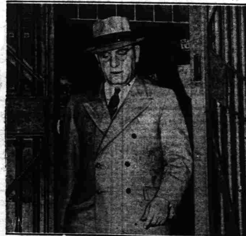
Dapper-looking Fritz Kuhn, fuehrer of the German-American Bund, leaves Tombs prison, in New York, after spending six hours behind bars. He was freed in $5,000 bail. Accused of stealing Bund funds Kuhn pleaded "not guilty."