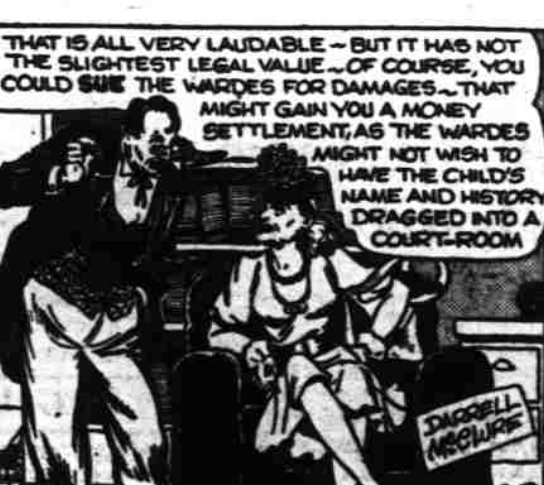
Under a Protecting Wing