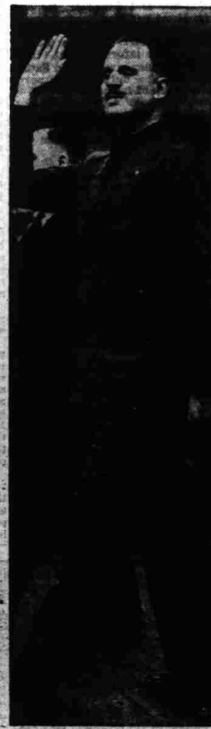
BRITISH ACCENT to fascism is supplied by Sir Oswald Mosley (above), who heads the British Union of Fascists. He's shown marching in a recent London parade.