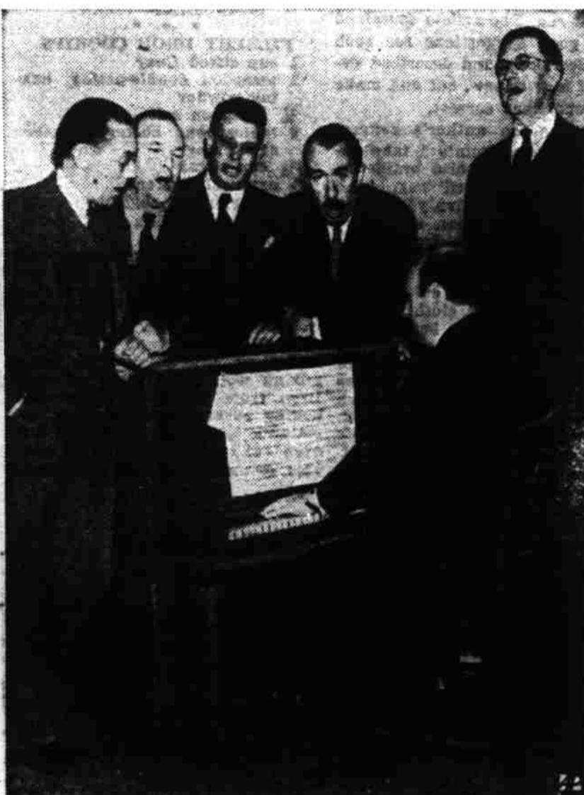
MUSICAL ARGUMENTS were played by Orchestra Leader Andre Kostelanetz (at piano) to persuade members of house committee on post office and post roads that a stamp honoring Composer Stephen Foster should be issued. Midway in Foster melodies are, left to right: John McDowell, Pa.; Clyde Garrett, Tex.; Pete Jarman, Ala.; Harold Flannery, Pa.; George Gilhe, Ind.