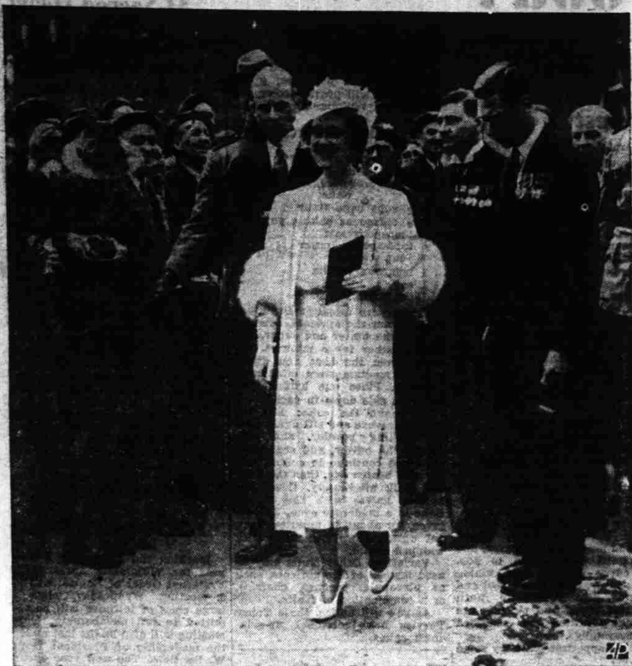
PRELUDE TO CONFUSION was this quiet scene as Queen Elizabeth and King George stepped past Ottawa crowds; soon they were engulfed by hand-shaking, back-slapping war veterans.