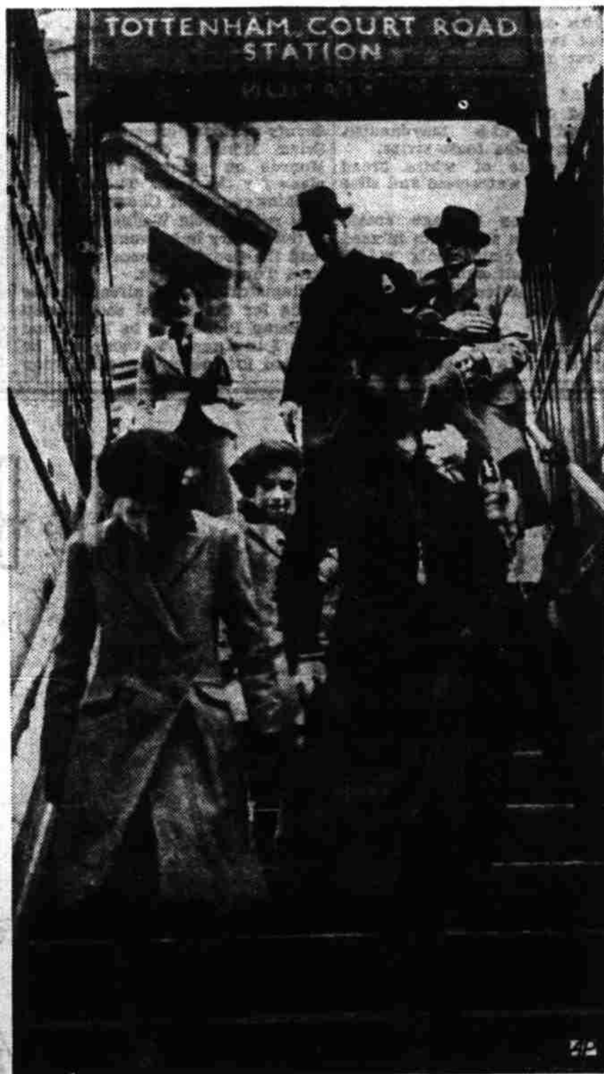
DEMOCRATIC DESCENT into a London subway—it's called the "Underground" there—took Princesses Elizabeth, 13, and Margaret Rose (rear), 8, on first subway ride. Travelling third class, they were accompanied by governess, lady-in-waiting.