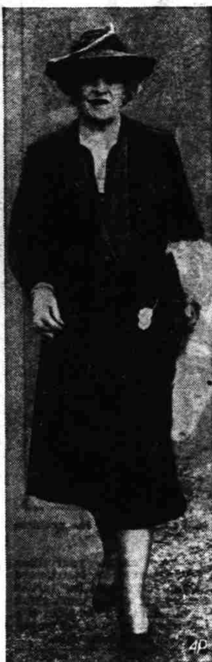
ABSOLUTE RULER of her social world, Mrs. Cornelius Vanderbilt varied her patronage of the arts with above attendance at the race track in Belmont Park, N. Y.