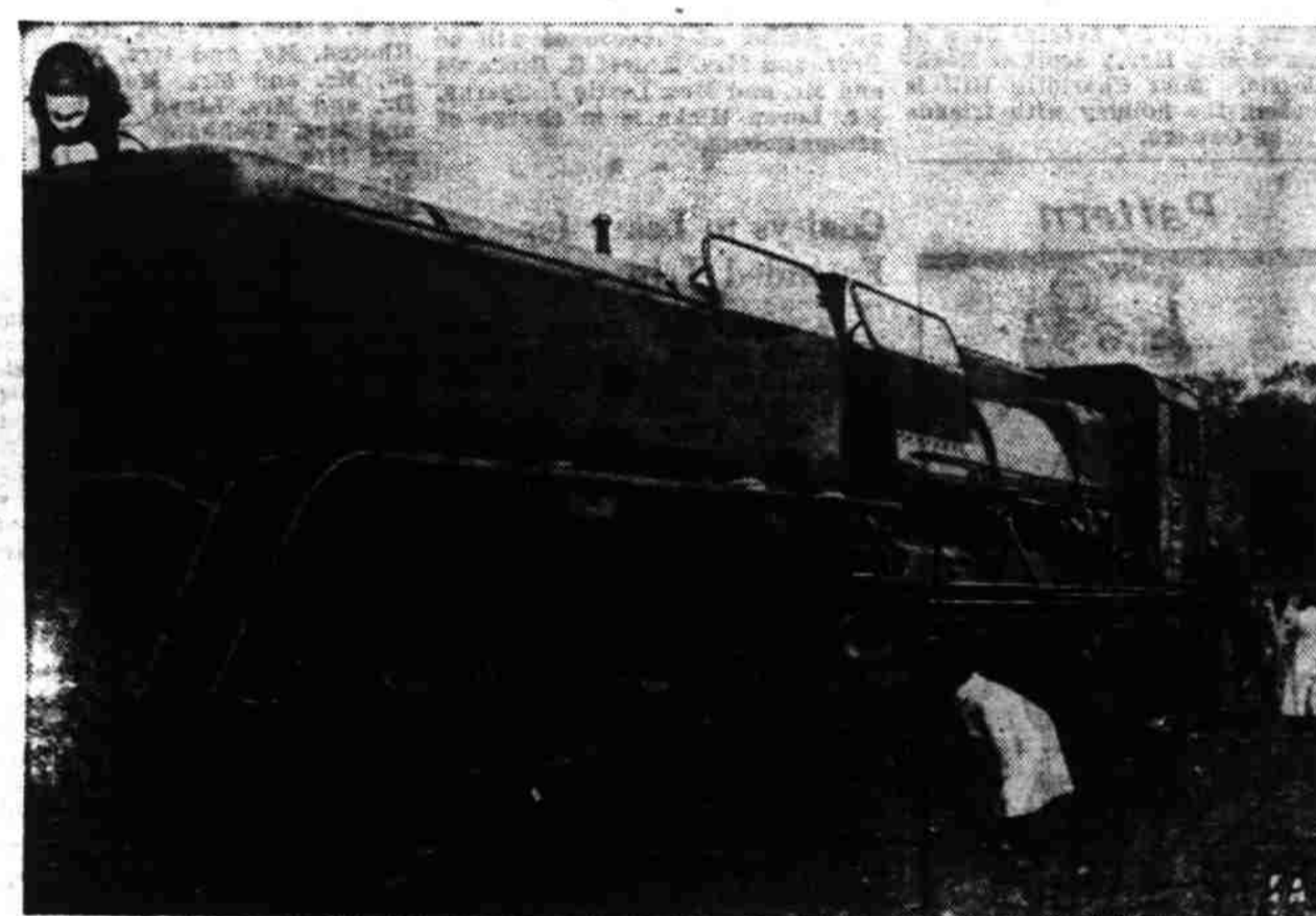
IS IT WORLD'S LARGEST? France thinks so, completing this 100-foot-long locomotive for West African service. Engine has 28 wheels, weighs 160 tons. Note odd design.