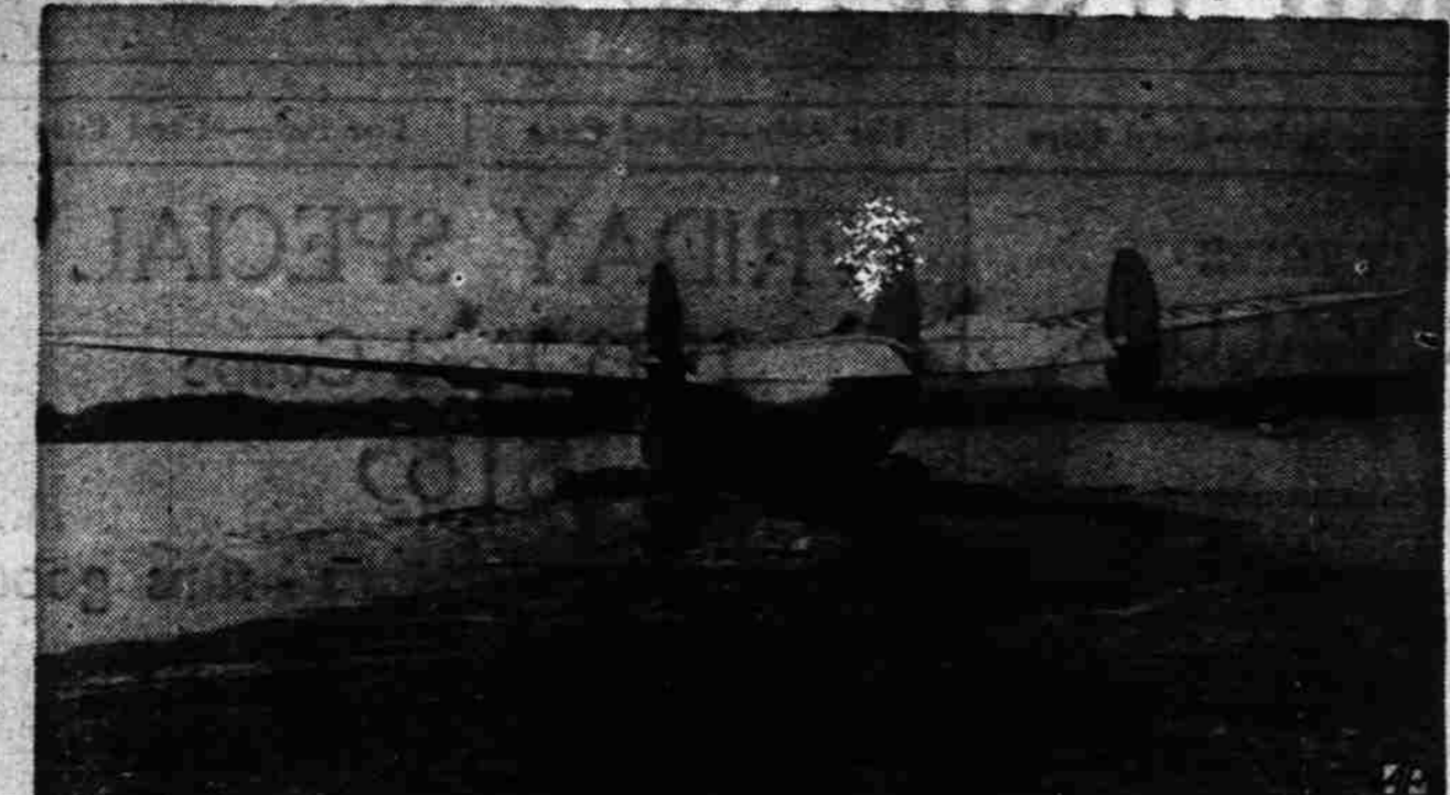
Airmail service between the United States and Europe was inaugurated when the Yankee Clipper, 42-ton flying boat, with 100,000 letters as well as heavier mail, left Port Washington, N. Y. The giant flying boat is shown taxiing away on the takeoff.

How many "SCREWDRIEVERS" can you find in this picture?