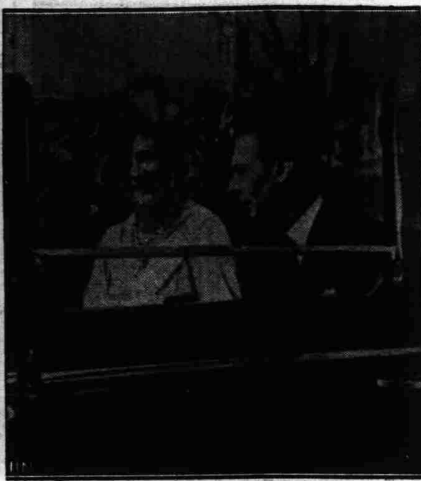
As king and queen rode in park

Canada welcomes King George VI and Queen Elizabeth of Great Britain with colorful parades, luncheons, banquets and pageantry and the camera shows you two of the scenes during the royal couple's stay in Quebec city, first stop on their month's visit. The photos show the parade tendered the king and queen with the parliament building in the background and a closeup of the royal couple.