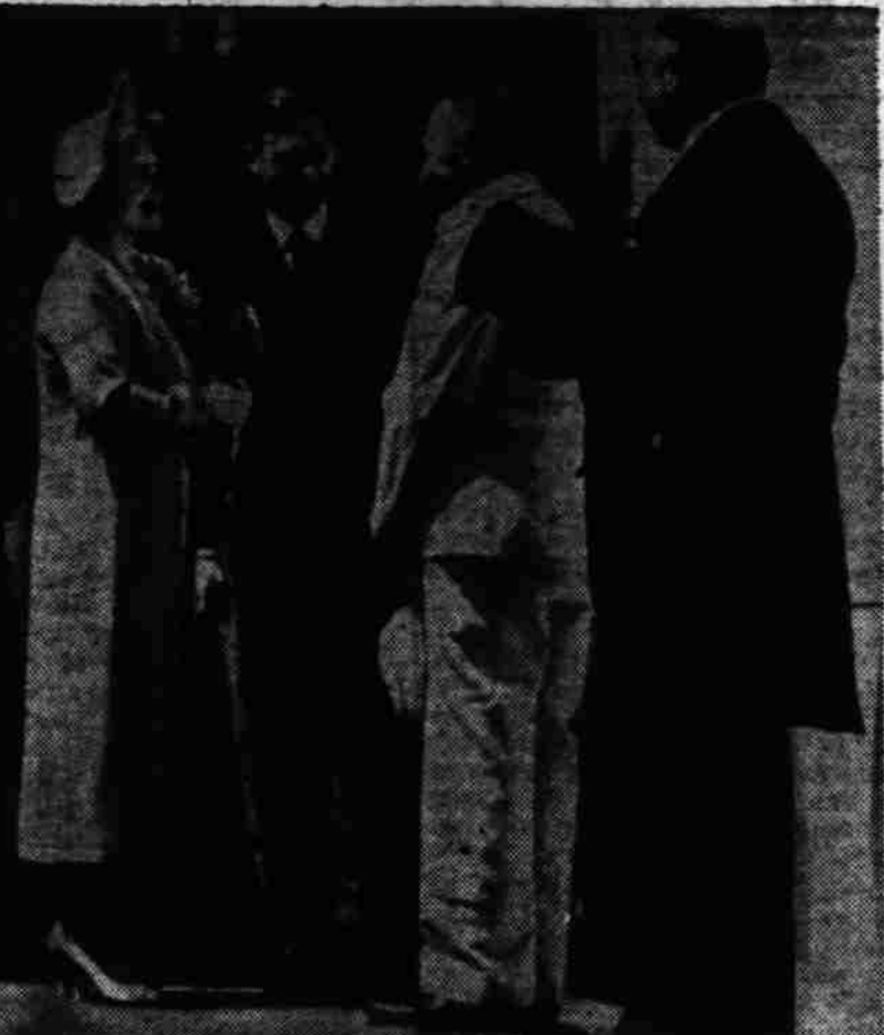
After participating in the ceremony of laying the cornerstone for the new Canadian supreme court building at Ottawa, Queen Elizabeth II paused to chat with a workman who aided her. King George looked on and smiled. Premier MacKenzie King is at right. The cornerstone ceremony was marked by the queen's first public address.