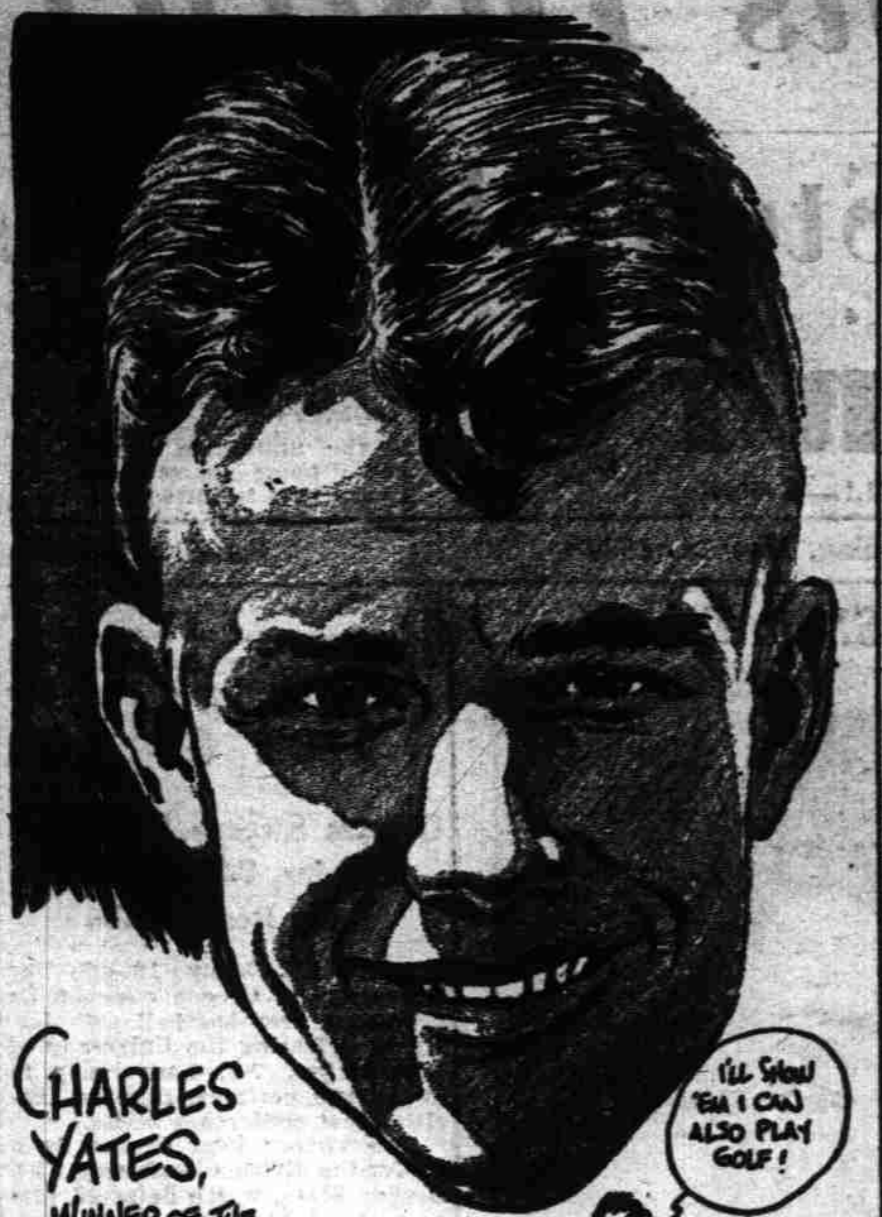
CHARLES YATES, WINNER OF THE BRITISH AMATEUR GOLF CHAMPIONSHIP IS OFF FOR ENGLAND TO PREPARE FOR THE DEFENSE OF HIS TITLE, MAY 21-27. ALL WORTH WHILE, WILL KNOW AS A TENNIS STAR WILL ALSO MAKE THE TRIP TO PLAY IN THE BRITISH TOURNAINT.