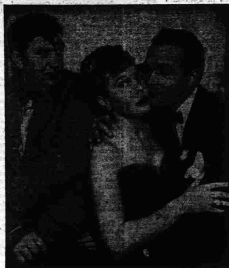
One man's mate is another man's poison in "Never Say Die," which opens today at the Capitol theatre with Bob Hope, Martha Raye and Andy Devine topping the cast. Also featured is "Frontier Pony Express," and Lone Ranger.

HOLLYWOOD 15 Today - Monday Tuesday Continuance Performance Today - 2 to 11 P. M. BOBBY BREEN with LEO CARRILLO FRANK MURPHY and The Higgins Family James Gleason Lucile Gleason Added - News and Cartoons