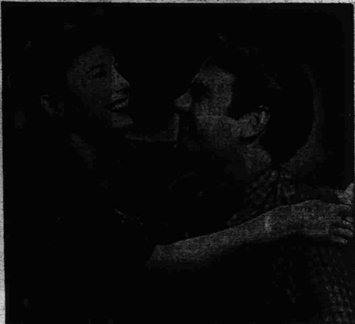
Love-making, building a great railroad, fighting Indians and contending with the hostile forces of nature occupy the arms of Barbara Stanwyck and Joel McCrea, the co-stars and romantic leads of "Union Pacific," story of the first transcontinental railway, playing today at the Elsinore theatre.