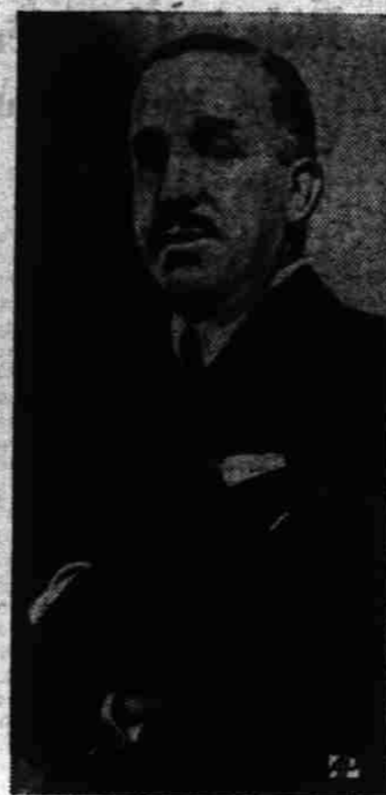
FORTUNES OF WAR altered the fortunes of Alfonso, former king who's been an exile since Spain became a republic in 1931. Franco-controlled Spain recently restored to the royal family all the private property it owned before 1931.