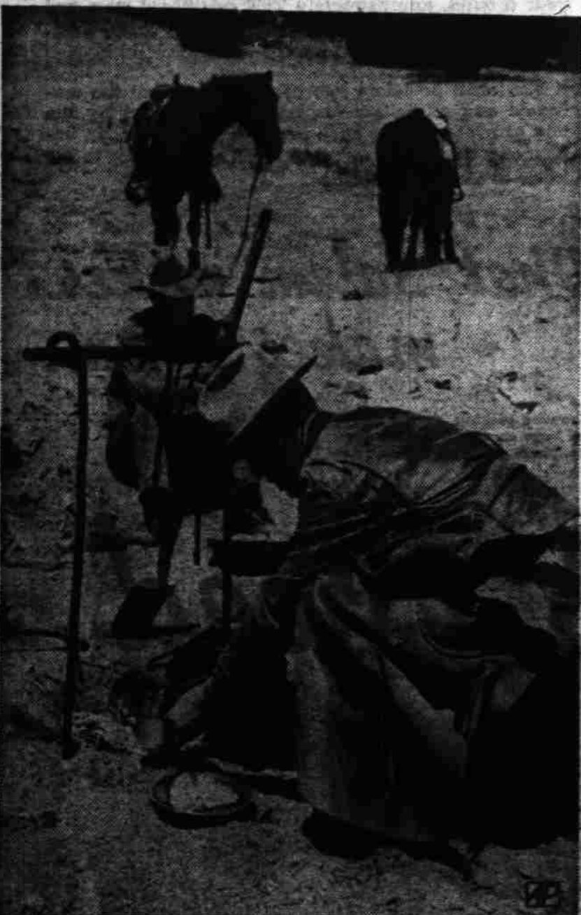
WHEN IT'S CHOW TIME in New Mexico's cattle country the cowboys driving herds to summer pastures, or to shipping pens, stop (as above) for the usual beans, biscuits and jam. These herd from the 70,000-acre Brammer ranch, northwest of Albuquerque. Four-day trek of 1,500 cattle from Sonora, Mexico, to New Mexico's Bear mountain pastures is typical trip.