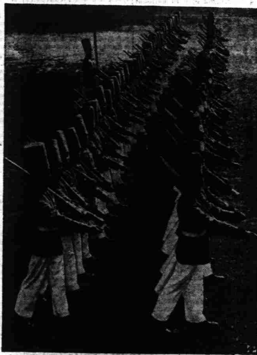
BRITISH 'TOY SOLDIERS' march—but only on the drill grounds of a Dover military school, preparing a "toy soldier" act for the Olympia tournament. England's most recent answer to the dictator's threat of arms was a conscription program to give 210,000 men in their 21st year six months of training.