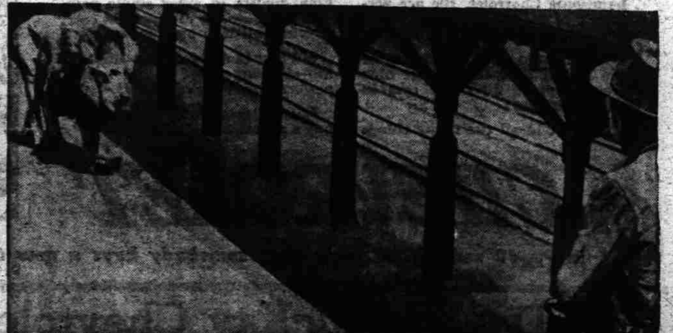
URGENT BUSINESS ELSEWHERE emptied the walks when this lion escaped from a circus car at Boston and had 10 minutes of freedom. At the right is a wary would-be captor.