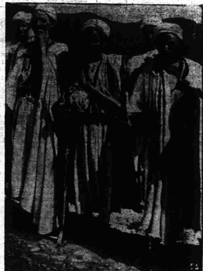
FRENCH EMPIRE DEFENDERS , these barefoot warriors of French Morocco make up in fierceness for any lack in uniform. In his recent discussion of British conscription, Chamberlain said the "gibe that Britain was ready to fight to the last French soldier was being bandied about from capital to capital."