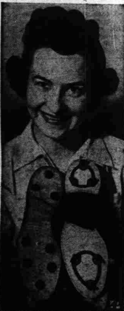
WRONG SIZE shoe for her, but the Baron of Detroit finds interest in a new type baseball shoe to be tried out by the Tigers in practice sessions this season. The new shoe (left) compares with the regular cleated baseball shoe (right).