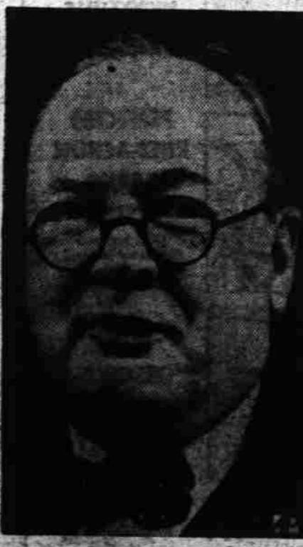
TRUCE was declared in the persistent opposition of Winston Churchill (above) to the policies of Prime Minister Chamberlain when the latter proposed conscription in England. Churchill, an arch Chamberlain critic, supported this measure.