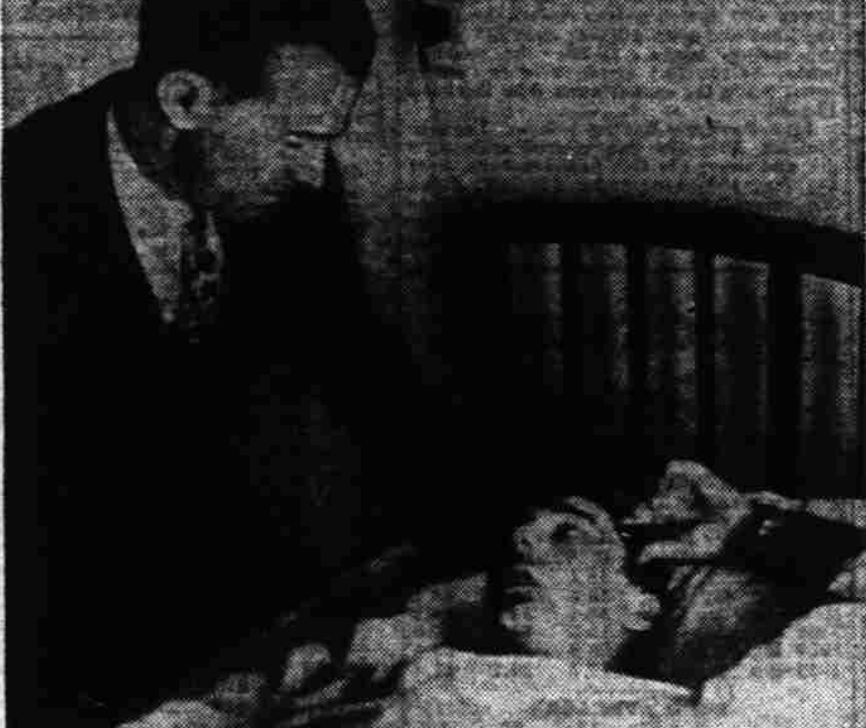
Phil Cavaretta, Chicago Cubs outfielder who suffered a broken ankle when he slid safely into second base during a game with the New York Giants in New York, is shown in his hospital bed as he receives the sympathies of a teammate, Dick Bartell, Cubs' shortstop. Cavaretta's consolation was that the Cubs won, 4 to 2.