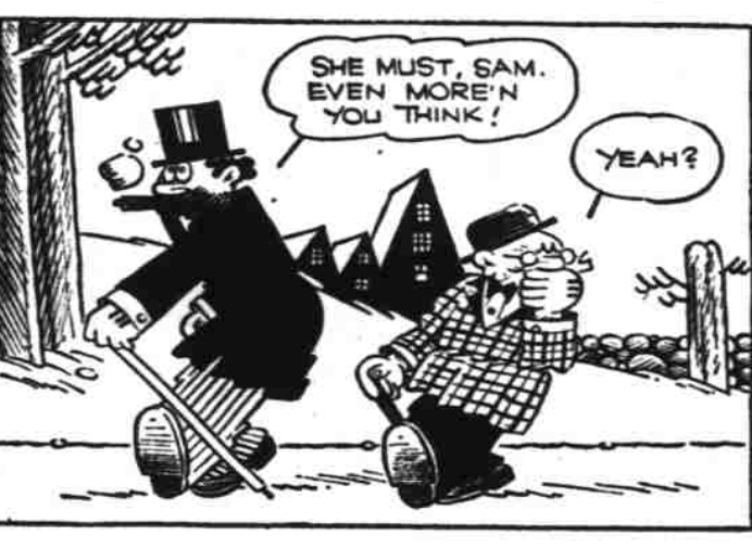
Dinner's Come—and Gone!