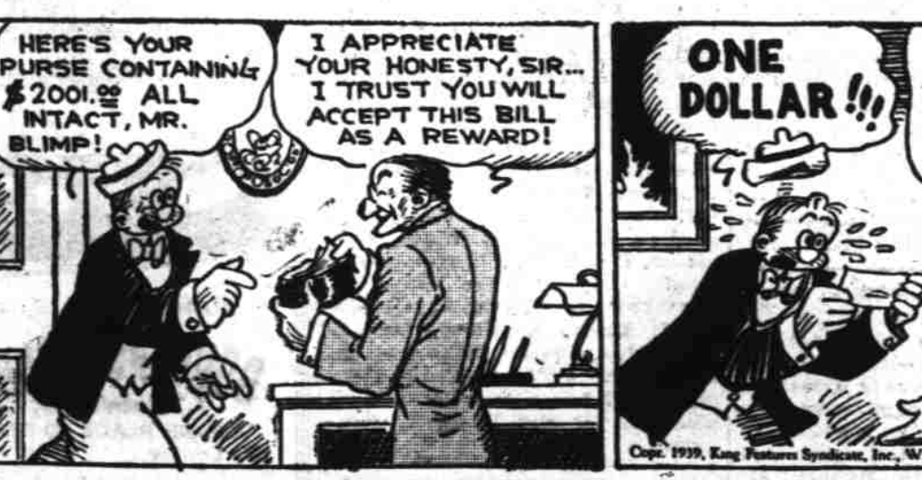
THIMBLE THEATRE—Starring Popeye