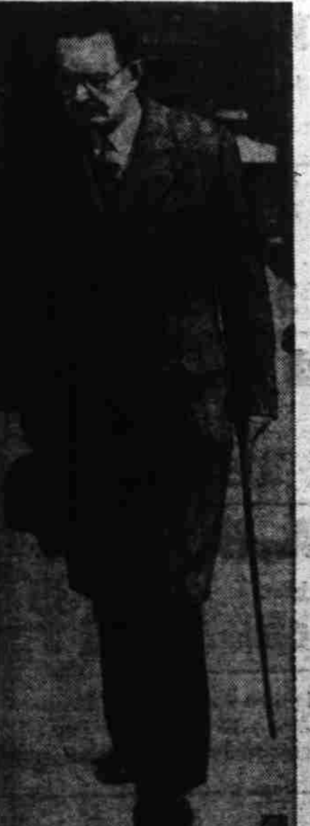
THE NEXT STEP among Europe's dicinters will take his nation where numbers Politics