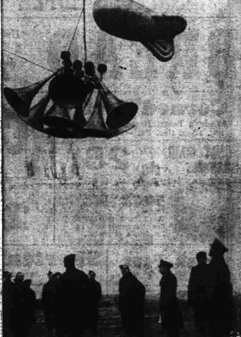
OUT OF THE CLOUD'S a warning voice will come to tell Britons of air raid dangers. That's the theory which led to above demonstration of England's much-discussed balloon harrage near London. The speakers have a range of five miles.