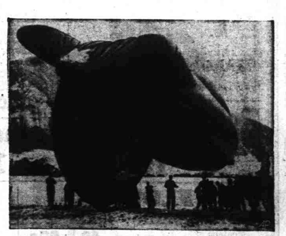
A SWISS 'MISS' sent this balloon on an unscheduled jaunt from Buchs airdrome to Graubuenden, Switzerland, during the inauguration of a Swiss balloon air raid barrage. An unexpected storm tore the great bag loose from its wires.