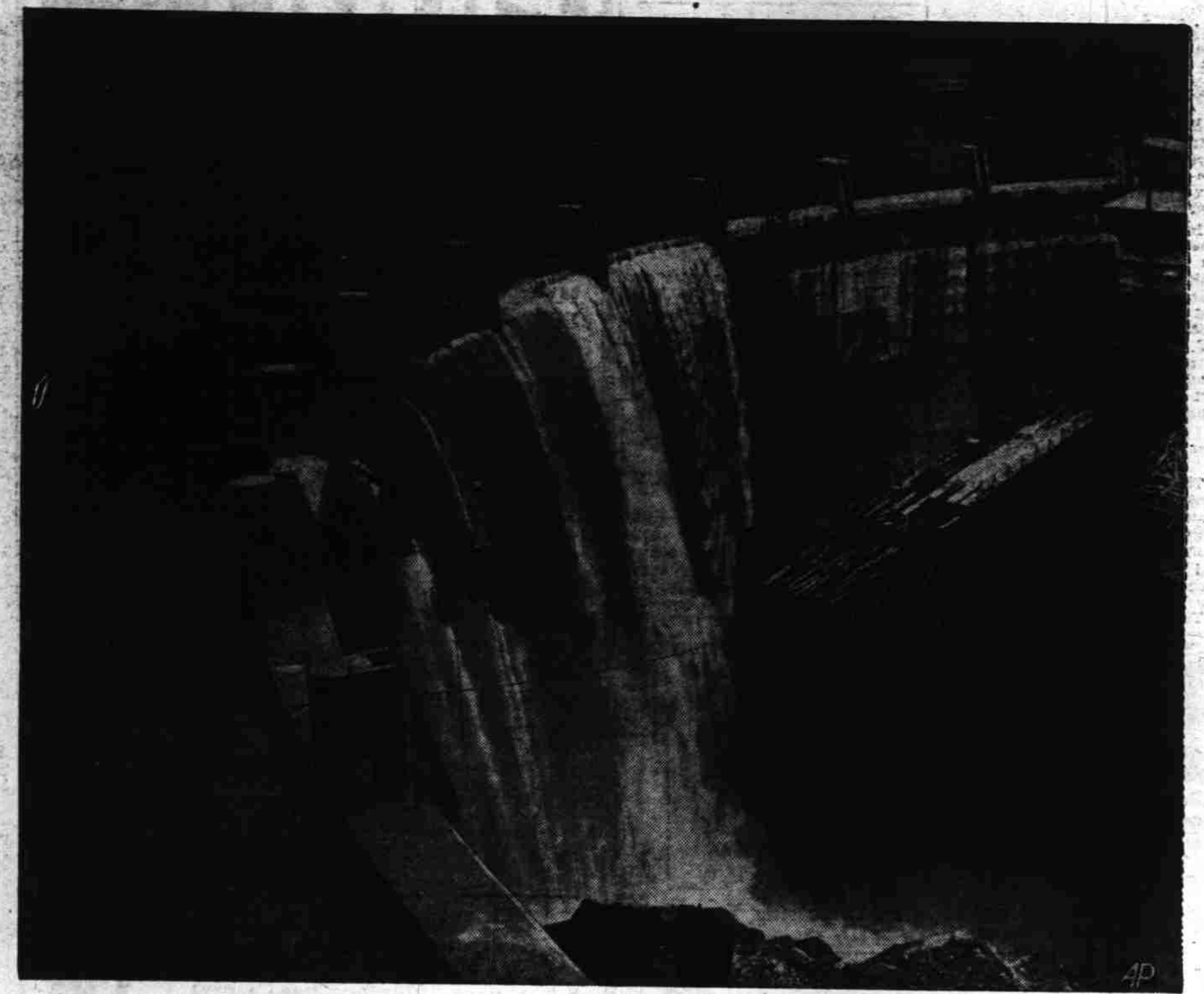
DAWN OF NEW DAY FOR HYDRAULIC MINING may bring a gold boom to land around Auburn, Cal., where this concrete barrier 155 feet high crosses the American river, as the first of a series of debris dams being built under the direction of army engineers. Before hydraulic mining was legislated out of existence in 1893 after years of strife between miners and farmers, it produced the bulk of the gold mined in California. The lake is intended as a settling basin for diggings unworked for years.