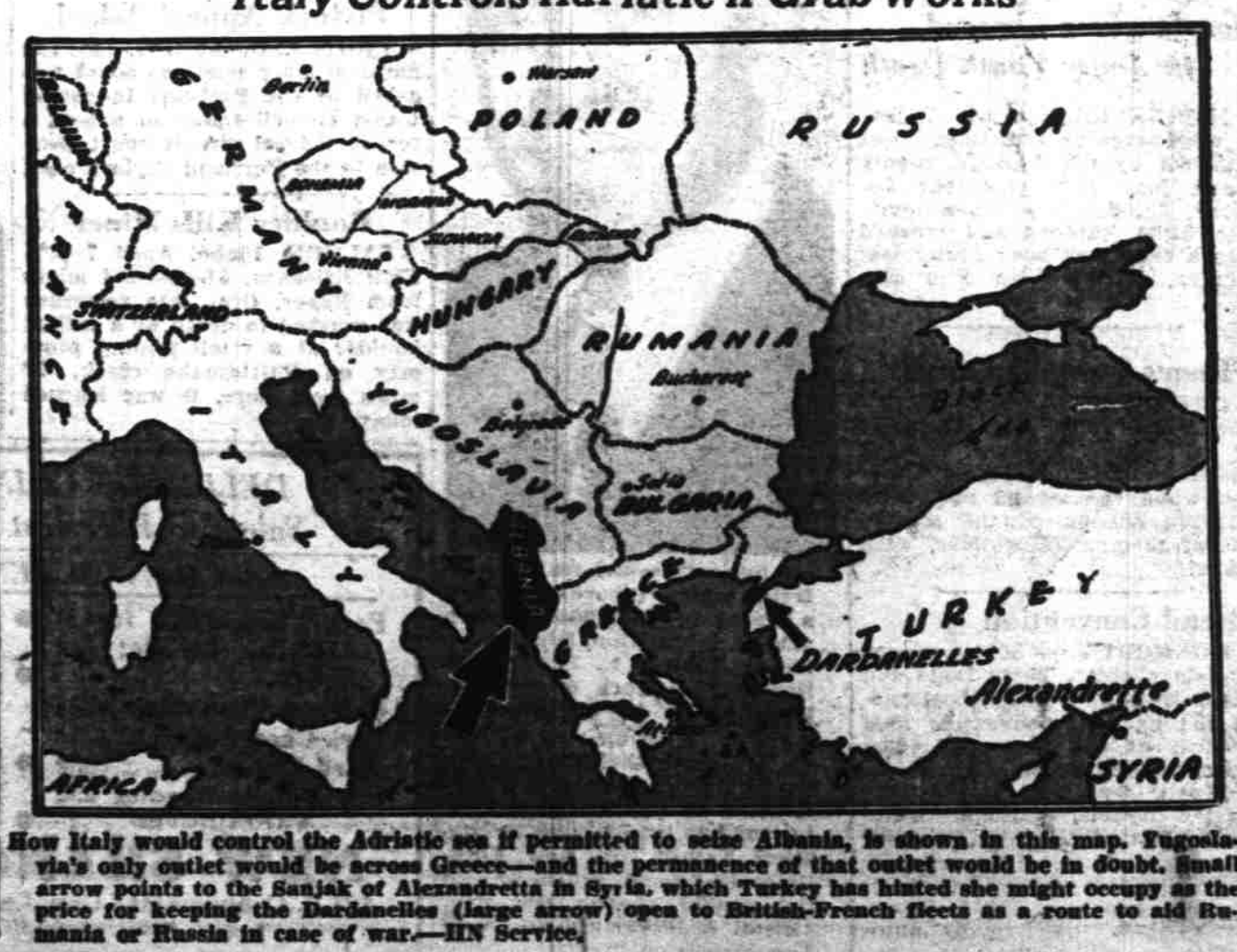
How Italy would control the Adriatic sea if permitted to seize Albania, is shown in this map. Yugoslavia's only outlet would be across Greece—and the permanence of that outlet would be in doubt. Small arrow points to the Strait of Alexandretta in Syria, which Turkey has hinted she might occupy as the price for keeping the Dardanelles (large arrow) open to British-French fleets as a route to aid Rumania or Russia in case of war.

KANSAS CITY, April 7.—(AP)—Fruit crops throughout the southwest suffered killing frosts last night.