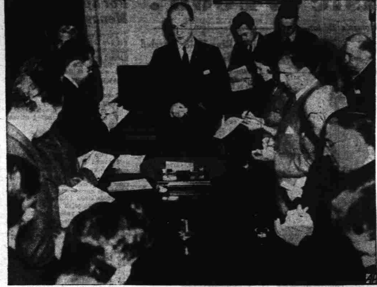
The United States government formally communicated to Germany its stinging "condemnation" of Hitler's seizure of Czechoslovakia as an act of "wanton lawlessness." Secretary of State Sumner Welles (center, facing camera), is shown as he released to Washington, D. C., correspondents the note. The note also said this government "does not recognize that any legal basis exists" for Germany's protectorate over Bohemia and Moravia.