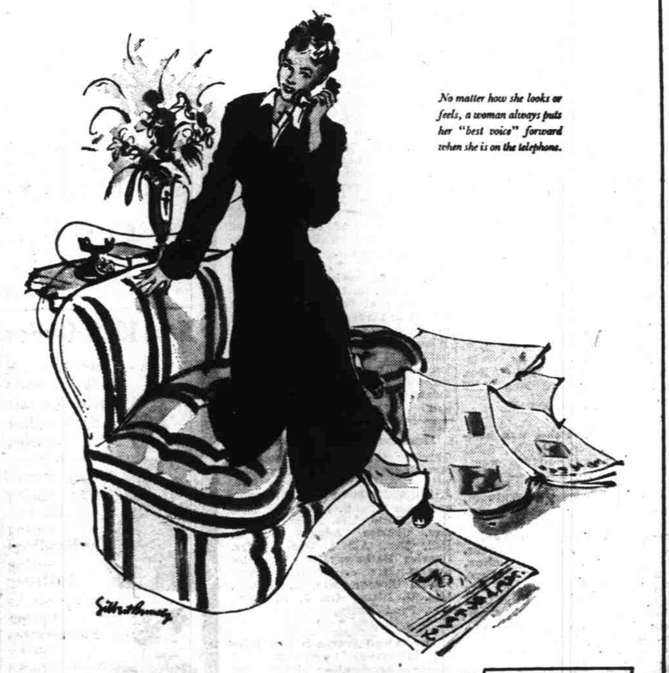
No matter how she looks or feels, a woman always puts her "best voice" forward when she is on the telephone.