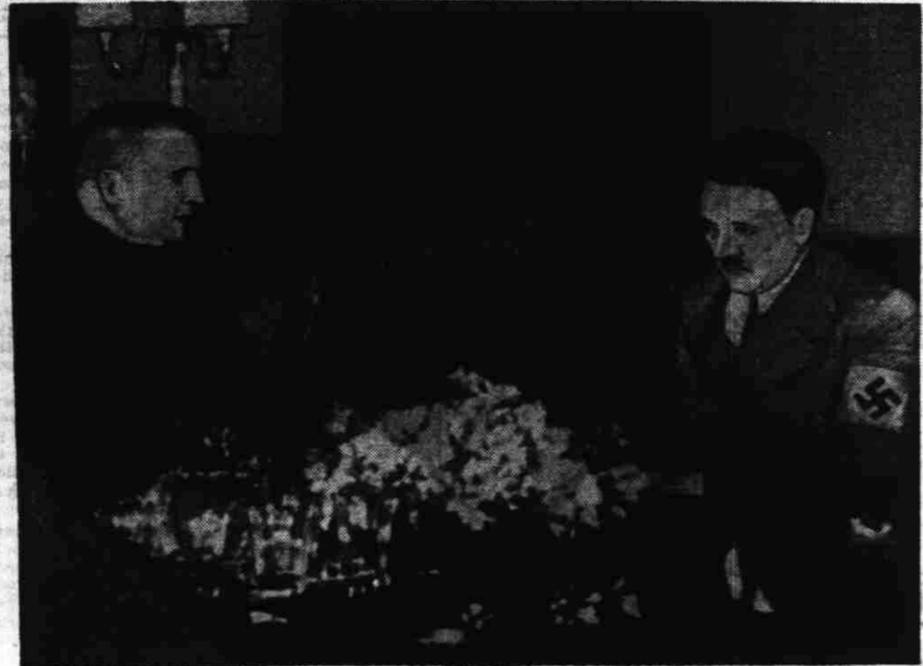
Dr. Joseph Tiso (left), first premier of "Independent Slovakia," and Reichsfuehrer Adolf Hitler are pictured in Berlin during their recent momentous conference, during which Hitler pledged "full support" to Slovakia. He later conferred with Czech officials and signed a "protection" pact with them. As the Czech state was dissolved and German troops began marching into the new territory they were greeted with both cheers and jeers. In Prague the troops were greeted with what is known in America as the "Bronx Cheer." This is a radiophoto.

Thursday following a stroke which paralyzed his lower limbs.