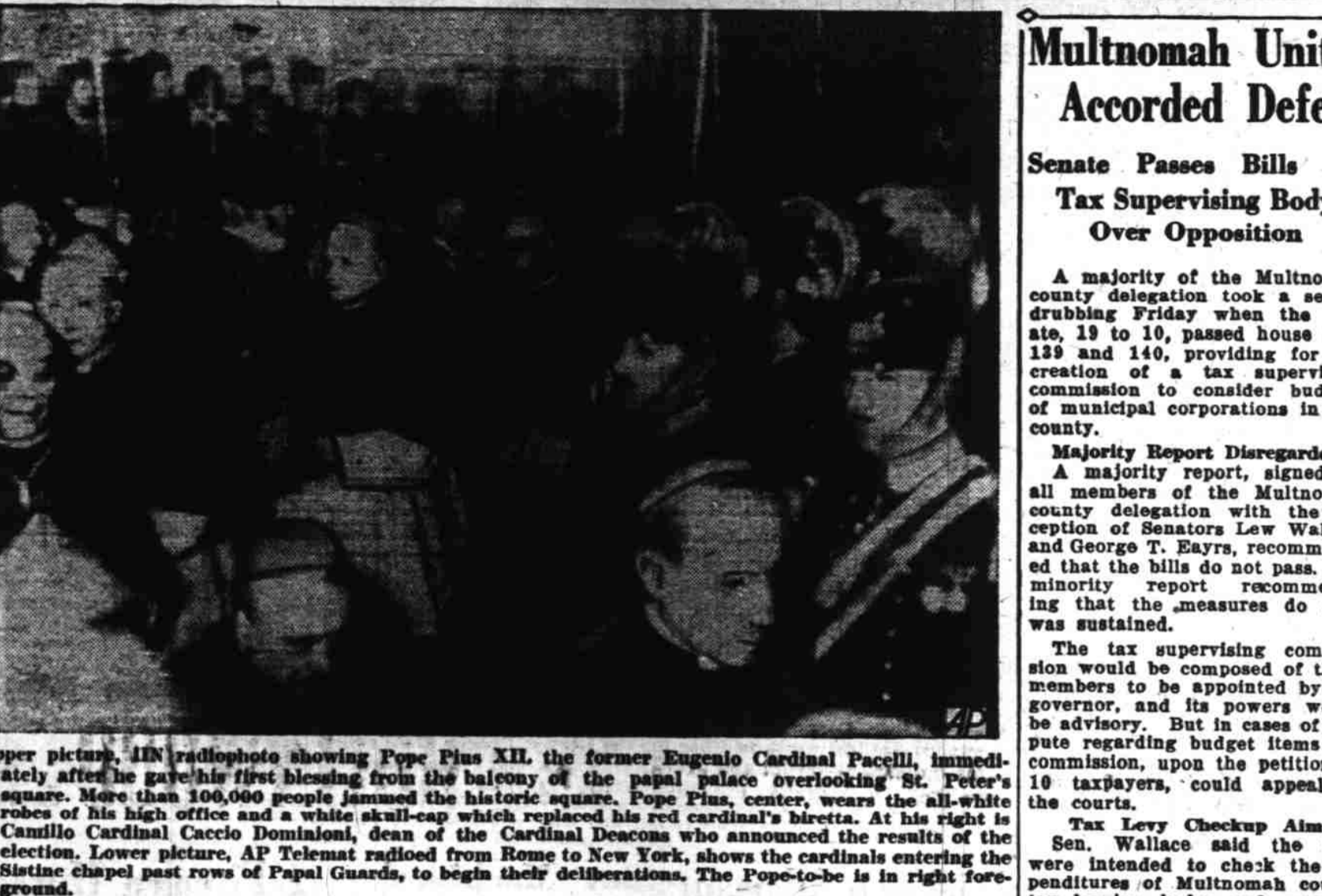
Upper picture, AP radiophoto showing Pope Pius XII, the former Eugenio Cardinal Pacelli, immediately after he gave his first blessing from the balcony of the papal palace overlooking St. Peter's square. More than 100,000 people jammed the historic square. Pope Pius, center, wears the all-white robes of his high office and a white skull-cap which replaced his red cardinal's biretta. At his right is Camillo Cardinal Caccia Dominioni, dean of the Cardinal Deacons who announced the results of the election. Lower picture, AP Teletext radiophoto from Rome to New York, shows the cardinals entering the Sistine chapel past rows of Papal Guards, to begin their deliberations. The Pope-to-be is in right foreground.